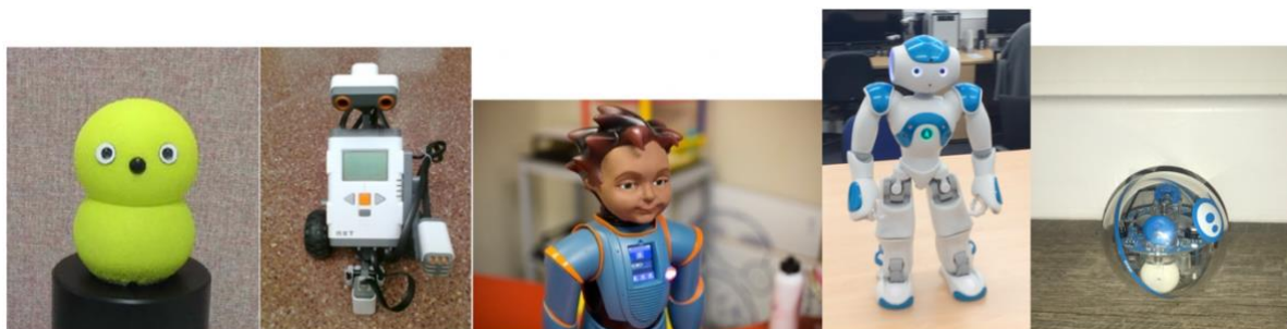
Figure 2. Some commercially available robots. From left to right: Keepon 5 , LEGO Mindstorms NXT 6 , R25 Milo 7 , NAO robot, and Sphero

teachers, from the UK, were involved in studies using robots in the classroom in the past or had previous experience in using this kind of robots. Most teachers were only aware of the existence of those robots with a stronger marketing presence, such as NAO and the LEGO Mindstorms, or others that they had previously seen in toys or technology retailers, with almost none of them used in previous research studies.