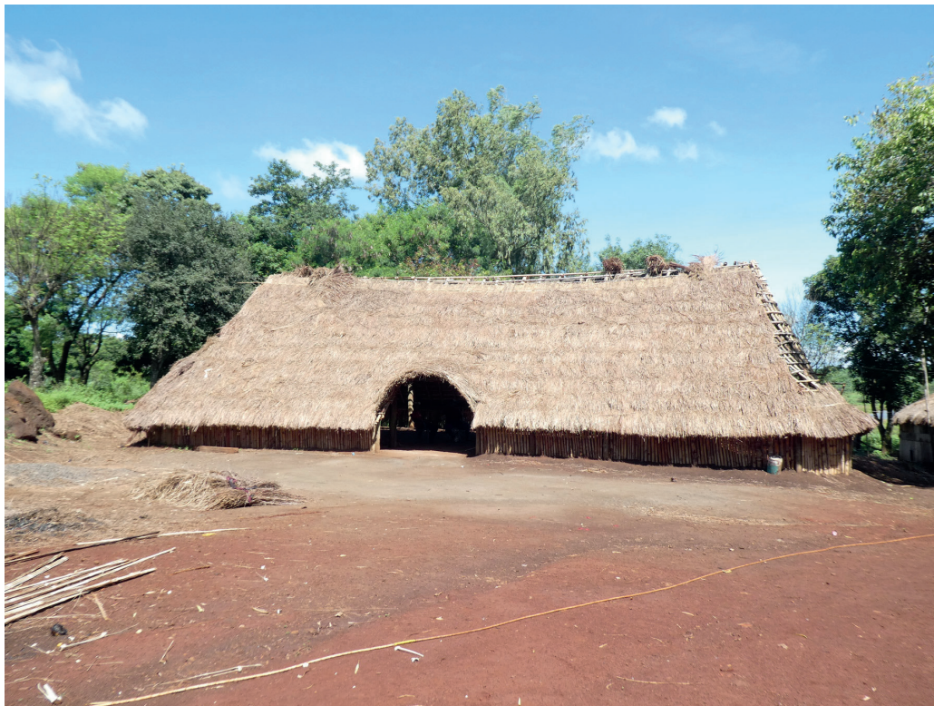
Image 2. Traditional family dwelling (now used primarily as a prayer house).