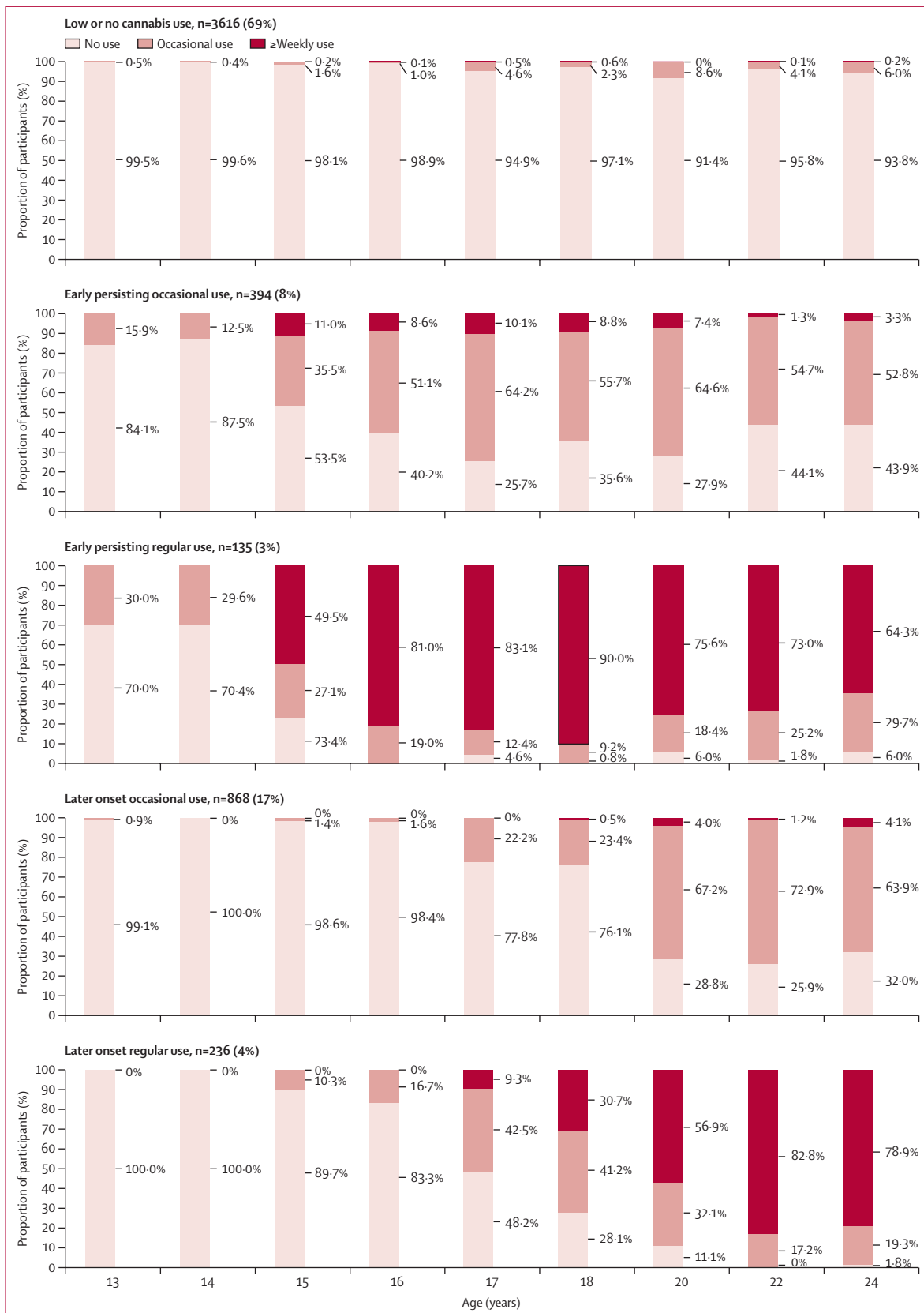
Figure 2: Cannabis trajectory classes showing timing and frequency of use at age 13–24 years (derived from repeated measures)