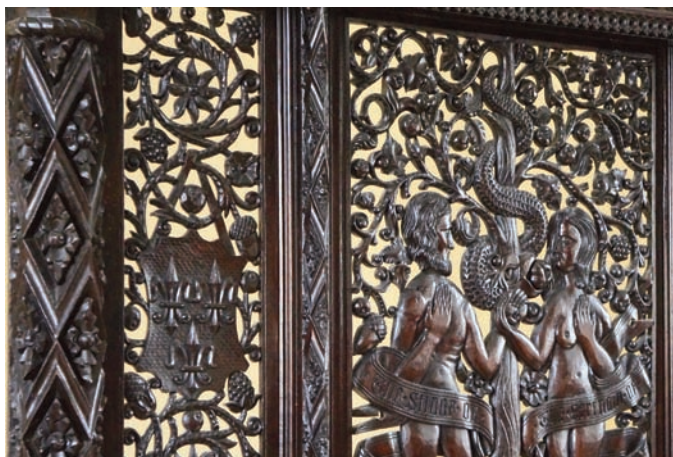
8 One of a suite of chairs for Chetham's Library, c1850.

towards the end of the Plantagenets, or in the Tudor period. This finely carved 15th-century royal marriage bed had an important impact upon Shaw's output in a number of ways. First, he reproduced it on a smaller scale, each time amending the royal arms on the headboard and footboard to those representing ancestors of the client in question. Probably the earliest example was one now in private ownership in Essex, sold by Sotheby's in 2005. 21 Its 4'9" wide frame retains some of the more complex details of the original, of a kind that were subsequently edited out of future versions as being too expensive. 22 This example features royal arms and 'H' 'R' on the headboard and posts, and a rose and Beaufort portcullis on the footboard.