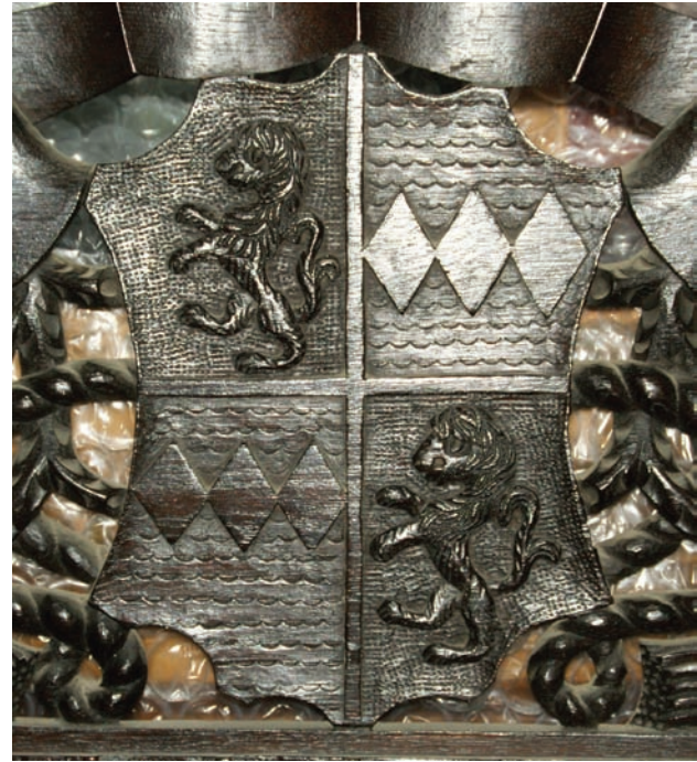
4 The Paradise Bed for the Duke of Northumberland, 1847.