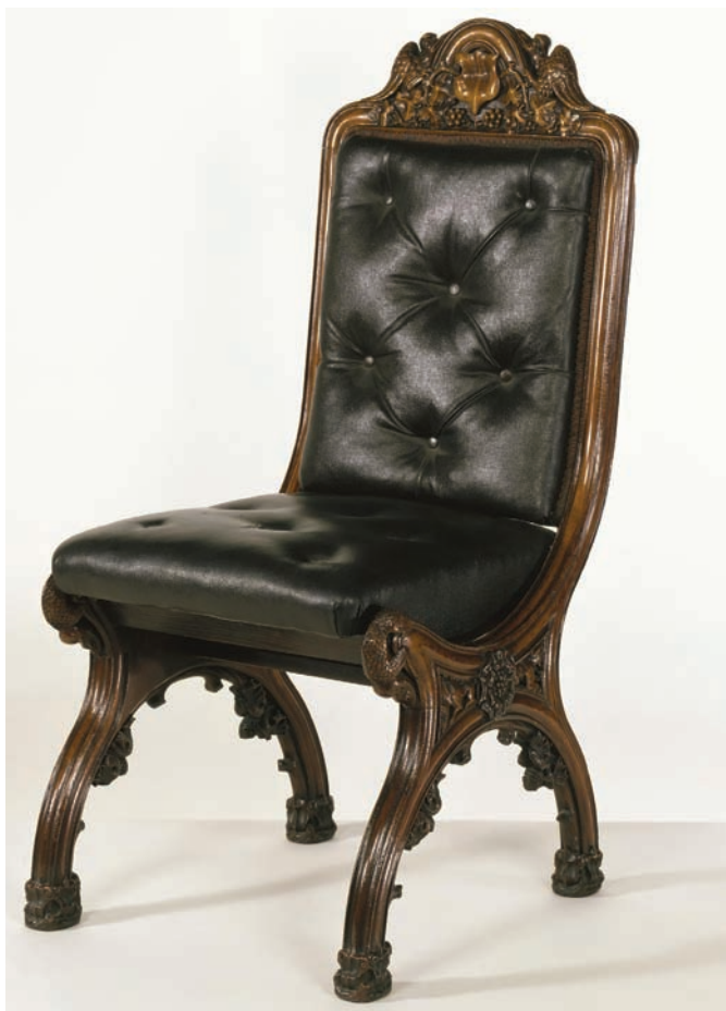
13 Detail of the Sideboard's apron, Chetham's Library, c.1850.

table-top's outer edge is nevertheless ornamented with the engraved and trefoil-leaf border derived from the rails of Henry VII's bed, and the tapered octagonal legs with cusped panels on the faces are far more akin to fashionable Gothic design included in books and serials on taste, such as Ackermann's Repository of Arts (especially 1825–27), or overtly architectural Gothic church furniture, for example, his work at St Chad's, Rochdale, from 1847 (Pl 7). 33