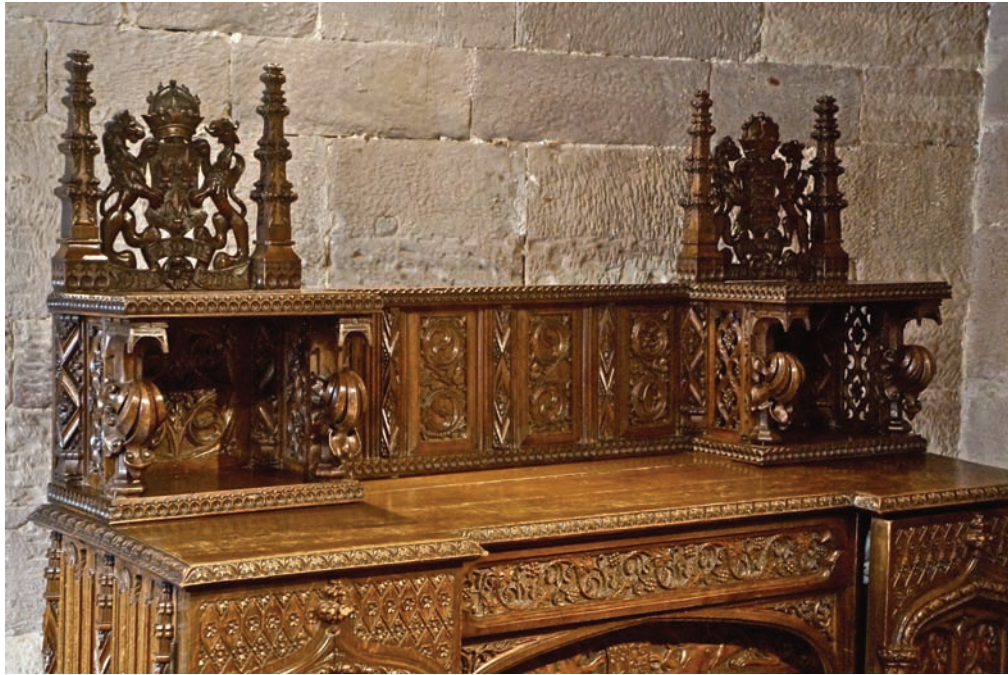
14 Detached Arms of France (moderne), from the Chetham's Sideboard, c1480s.