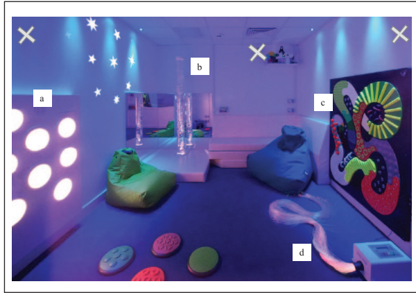
Figure 1. Image of the multi-sensory environment used in this study containing, (a) touch, sound and light board, (b) bubble tube, (c) Tactile board and (d) fibre optics. ‘X’ marks camera positioning, with all cameras pointing out and down. NB. The projected wall stars and textured floor dots were not included for the MSE sessions in this study.