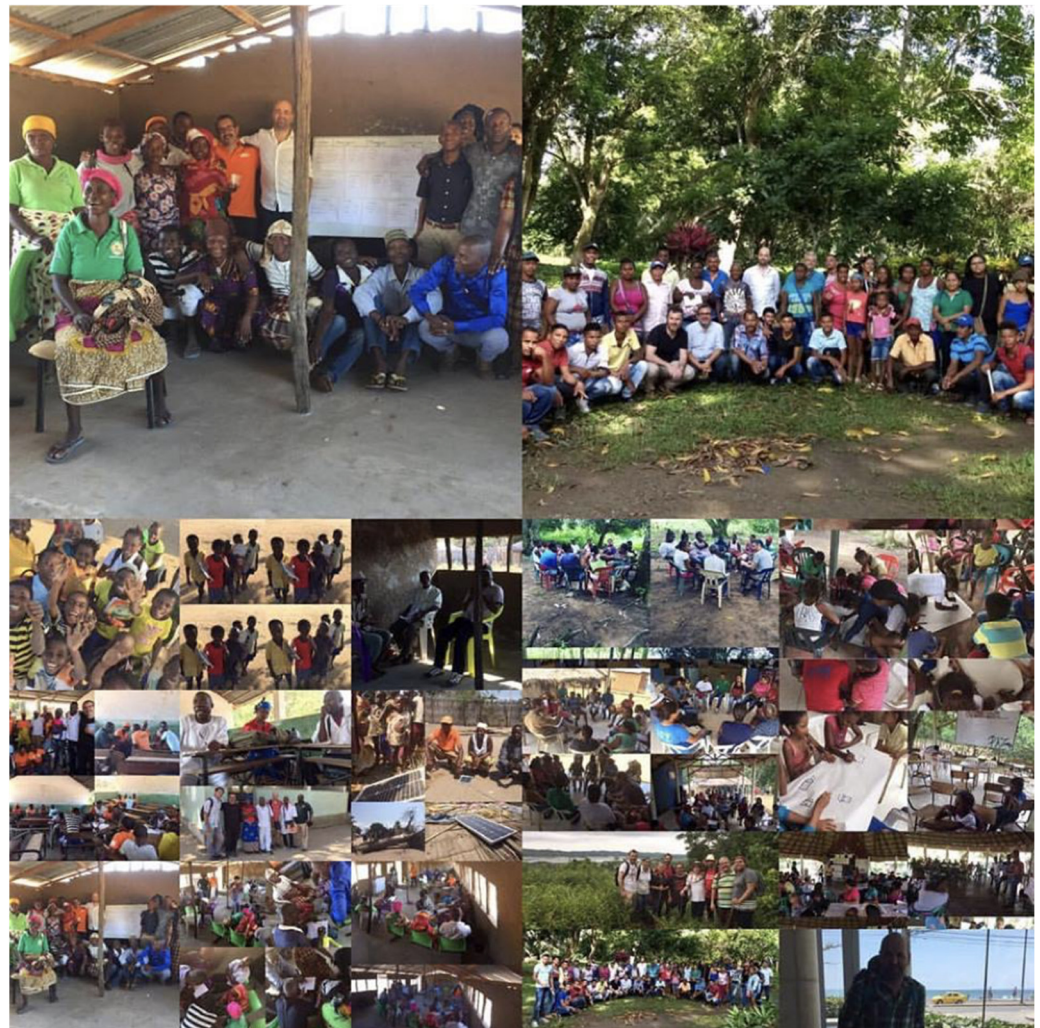
Figure 1. Mozambique and Colombia Fieldwork Action Research: SRC.

The project was led by the NGO Ayuda en Acción (Aid-in-Action), based in Spain, which implemented and applied the resulting strategic outcomes internationally across their territorial development areas and branches. While the NGO has been actively engaged in international aid efforts, this project enhanced the NGO's potential strategy by incorporating the 'smart' utilization of ICT, energy, mobility, education, health, gender, and governance advancements in conjunction with a participatory and experimental approach through Living Labs. The project aimed to update the operational framework of the NGO Ayuda en Acción as an international development and humanitarian aid organization.