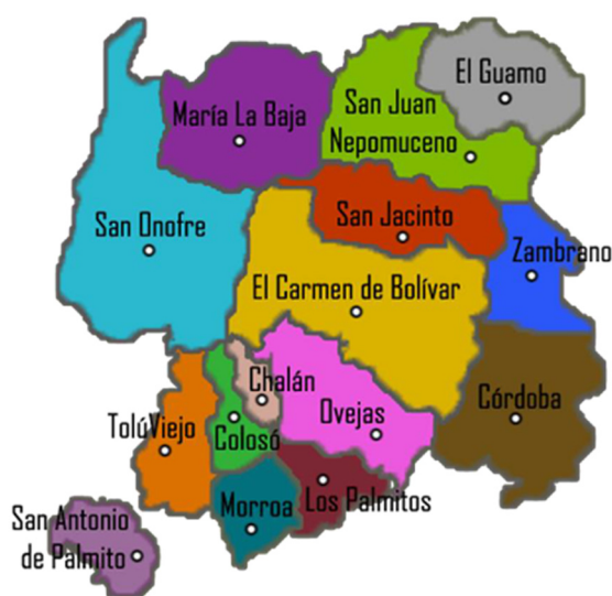
Figure 3. Colombia: Bolívar.

In Pemba (Mozambique) (Figure 4), the project focused on seven communities that were directly affected by various struggles. By 2017, the region of Pemba in northern Mozambique had already witnessed a significant increase in population due to the ongoing insurgency and violence in the area. Pemba, a city with a population of just over 200,000 in 2017, had experienced substantial displacement of people as a result of the insurgency. Nearly 690,000 individuals had been displaced since the insurgency began, with many seeking refuge in Pemba. During this time, the violence in northern Mozambique led to extensive destruction. Human rights groups documented incidents of killings, beheadings, and kidnappings carried out by the militant groups operating in the region. These attacks caused deaths and instilled widespread fear among the local population. In May 2021, reports emerged of people desperately attempting to flee Pemba and the surrounding area following a jihadist attack. Security forces had set up roadblocks, effectively trapping thousands of people. In their desperation to escape, some individuals had to pay bribes to be allowed to leave the town.