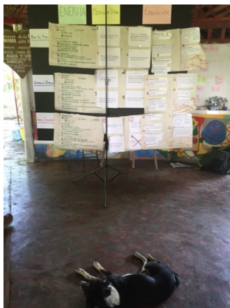
Figure 5. Colombia: Bolivar. Living Lab outcome.

The outcomes of step (i) are presented in the second section of this article, the outcomes of the fieldwork are presented in the third section, and the outcomes of the modeling are presented in the fourth section.