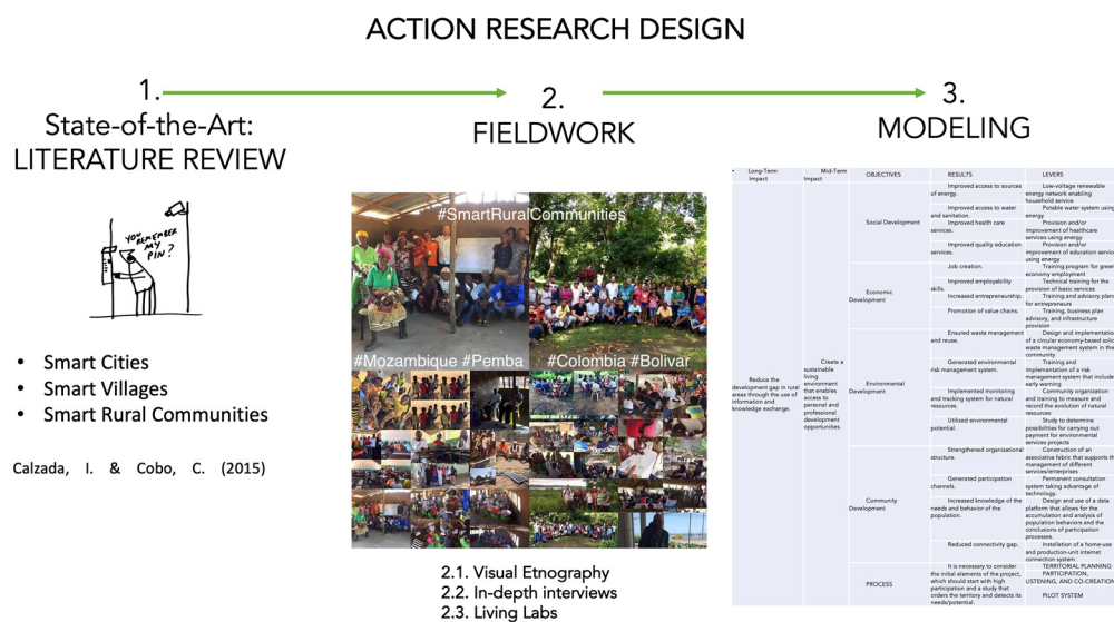
Figure 2. Action research design [41].

In the two aforementioned cases, residents from rural and remote communities actively participated in fieldwork action research. The project aimed to understand their perspectives and explore ways to enhance their daily lives by leveraging incremental technological advancements. The fieldwork sought to identify stakeholder groups and examine their interconnectedness in promoting community empowerment through smart strategies and cooperative socio-economic development at the grassroots level.