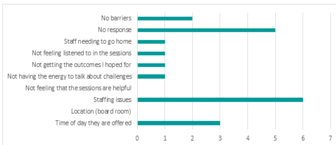
Figure 2. Number of respondents who indicated each of these potential barriers to attending the RPG had an impact on their attendance (figure by authors)