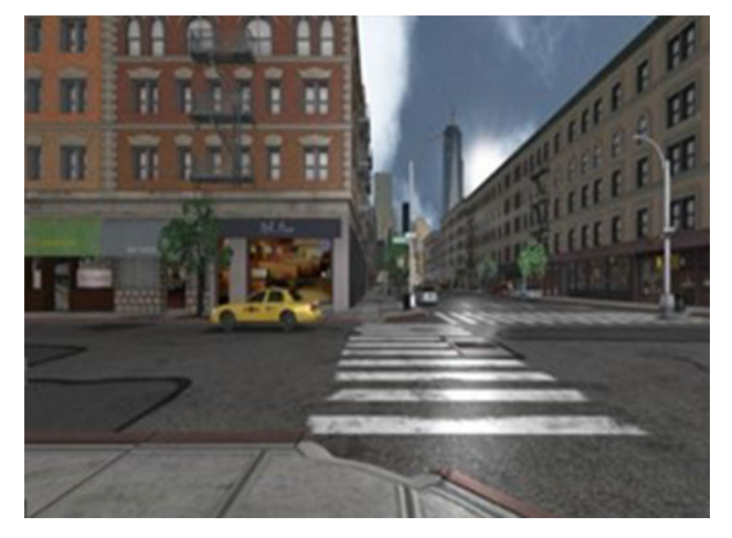
Fig. 2 Cityscape projected-screen display