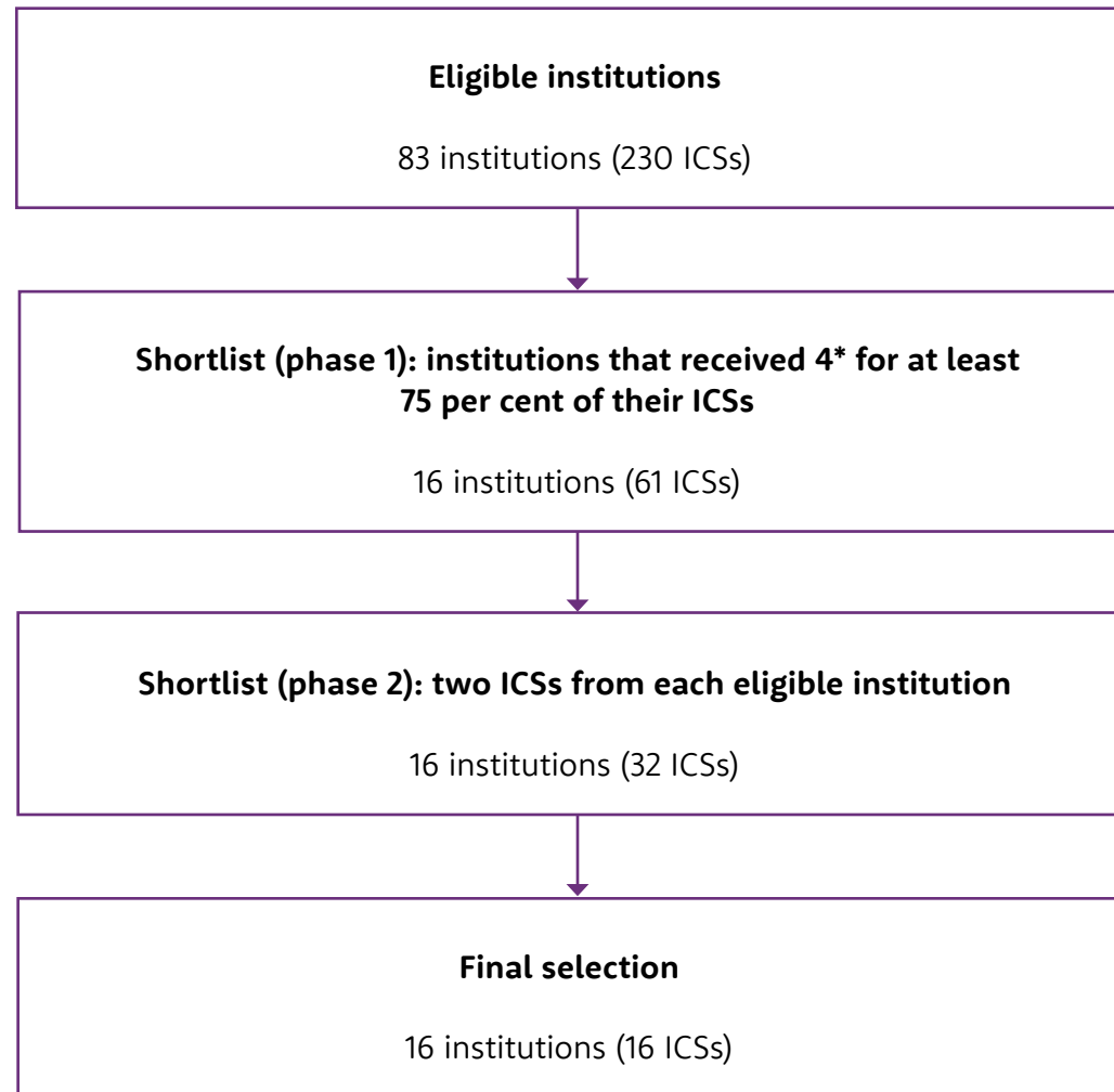
Figure 1: Shortlisting process

Notes: the REF 2021 website does not display all submitted ICSs; the final selection aimed to capture a range of different types of research.