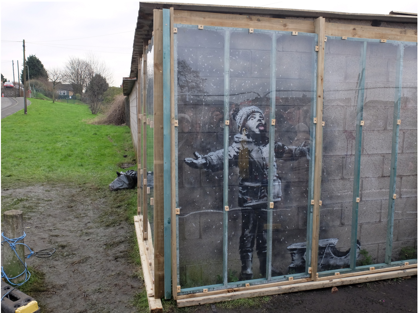
Approaching the Banksy mural at Port Talbot.

PT's air quality made headlines once again before the end of the year, as in the depth of night on 19 December 2018—seemingly inspired by news coverage of the town's troubles with industrial air pollution—anonymous street artist, Banksy, gifted the town a mural, which was painted on a former steel worker's garage (BBC News, 2018). Dubbed 'Season's Greetings', the mural uses the corner of the structure to convey its message: on one side it appears to show a child playfully catching snowflakes on their tongue; when the viewer turns the corner, however, they realise that the substance is not snow, but ash generated by a burning skip. The imagery deliberately instils a sense of discomfort as an innocent scene shifts to one that confronts the viewer with the toxic consequences of air pollution. Symbolically evoking the town's main source of employment as threatening to the health of both residents and the environment has served to keep the steelworks in the public eye. Framing the steelworks in this way is a source of great contention locally, however, particularly given the precarity surrounding the steel industry over the last four decades.