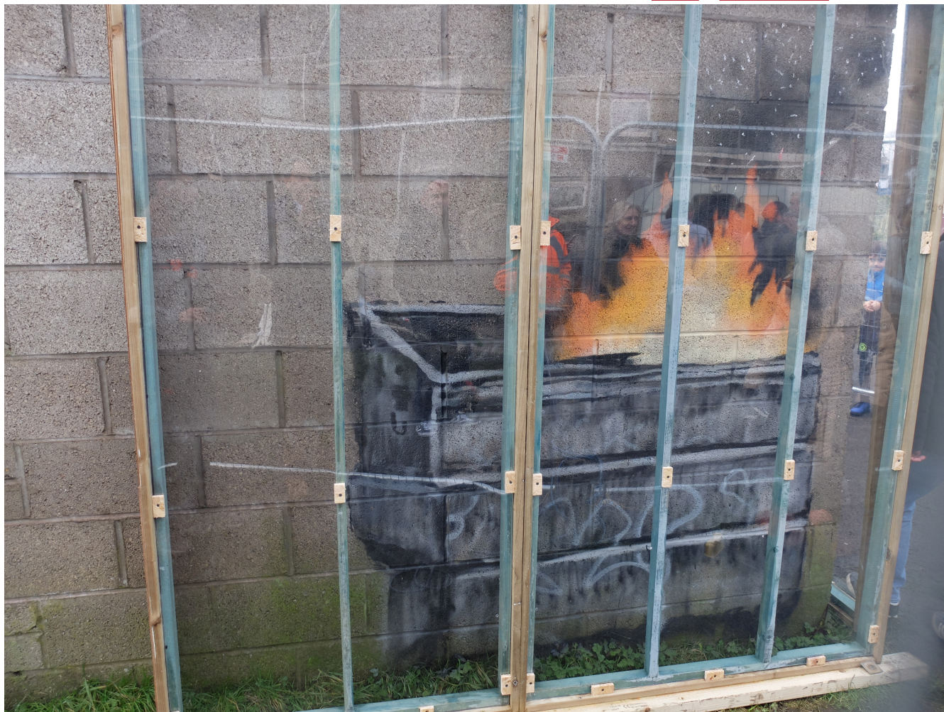
The image seen upon rounding the corner of the building (Banksy mural at Port Talbot).