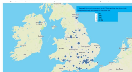
The map of England and Wales demonstrates for each NHFD the proportion of patients receiving parenteral therapy.