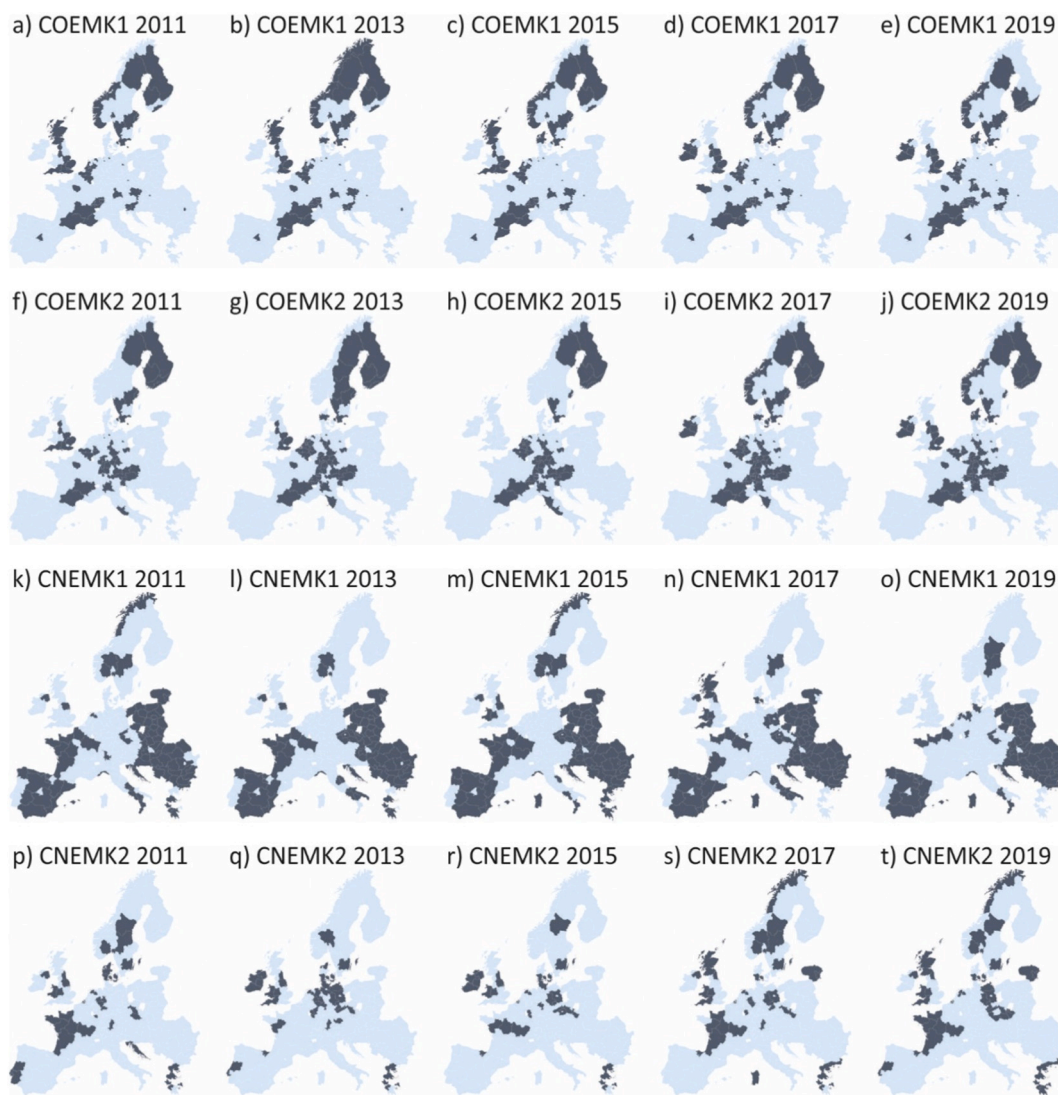
Fig. 2. Employment in knowledge-intensive activities recipe maps of associated European regions (in strong membership terms) shown by year.