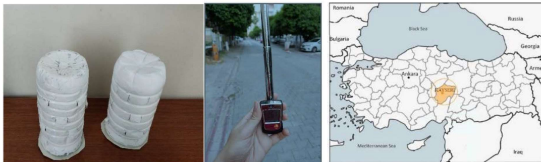
Figure 2. The equipment for in-situ measurements and location of Kayseri

The data collection was done in June. The in-situ measurement instruments are HOBO and Tiny Tag data loggers for the temperature and humidity, and the loggers recorded data every ten minutes (Fig.1). Besides, hand hotwire anemometer was used for wind speed. The shelters were used to protect the data loggers from direct sunlight. These measurements used for validation of the data from Envi-met.