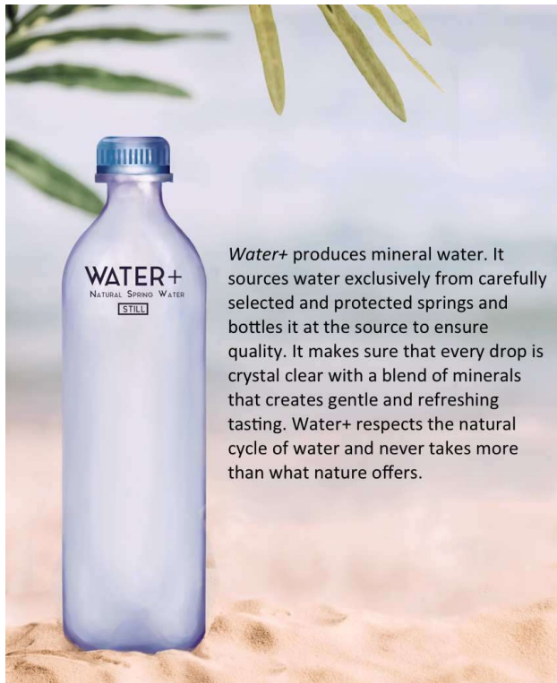
(a) Non-anthropomorphised stimulus