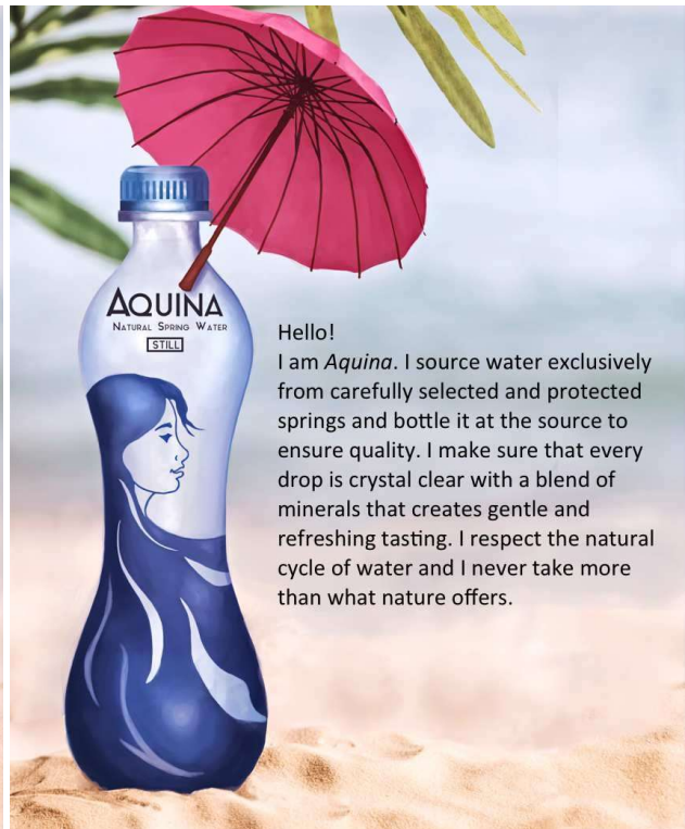
(b) Anthropomorphised stimulus