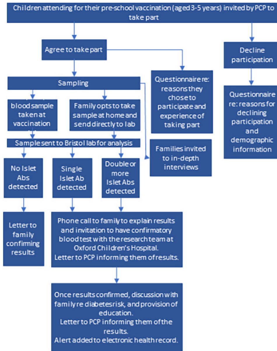
Figure 1 Study schema. Abs, autoantibodies; PCP, primary care practices.

define a ‘proof of concept’ study as providing the foundations of knowledge, 15 rather than assessing effectiveness.