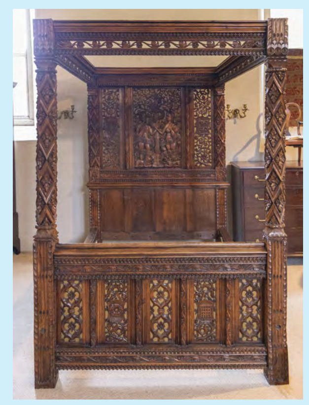
George Shaw's Henricus VII Rex bed, c.1842

These similarities, apparent on first glance, swiftly disappear upon close examination; style, material, construction, iconog-