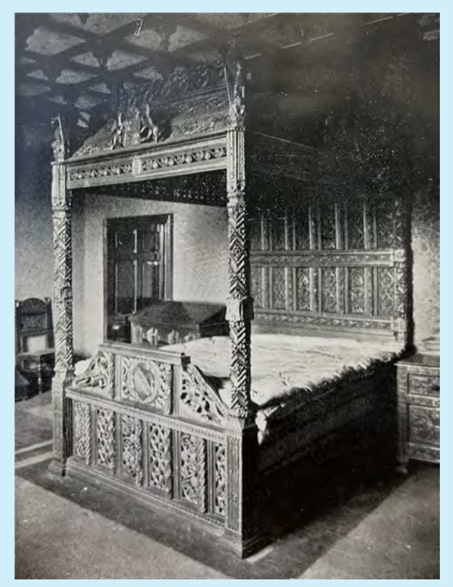
The Thomas Stanley Bed, photographed 1913

These beds, manuscript miniatures, and early modern prints illustrate our understanding of elaborate, royal, beds from Tudor England is, until now, incomplete. Not only does the Royal Tudor bed exceed the general understanding of furniture as decorative art, but that Tudor furniture could also serve as a vehicle for multi-layered iconography. Copying the Royal Tudor bed and selling these reproductions as genuine fifteenth-century relics, Shaw is a fundamental part of this bed's story. He gave the bed a remarkable nineteenth-century afterlife, and he celebrated its design and decoration as a preeminent model to inform three decades of architectural practice.