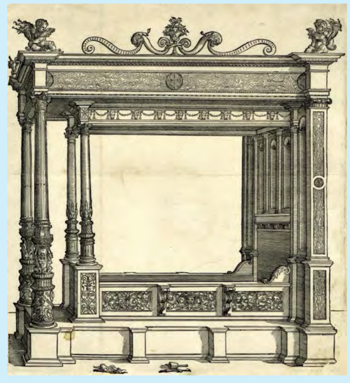
P. Flötner, State Bed, c.1540, 1992,0620.1, © British Museum, London

footboard is made from the same tree that most of the bed is made from, and that remnants of paint found on the footboard's surfaces are also late-medieval. Perhaps knowledge of medieval beds is incomplete? Well, footboard are found in manuscript illustrations of elite beds—royal examples included—as early as 1140. By the fifteenth century, several manuscript miniatures depict beds with footboards, and in the sixteenth century we find footboards depicted in prints of everything from modest to unimaginably elite beds, the latter including Peter Flötner's elaborate double-tester state bed (1540–41). When combined with visual evidence, the Royal Tudor bed challenges and redefines what the most ostentatious beds could, and did, look like.