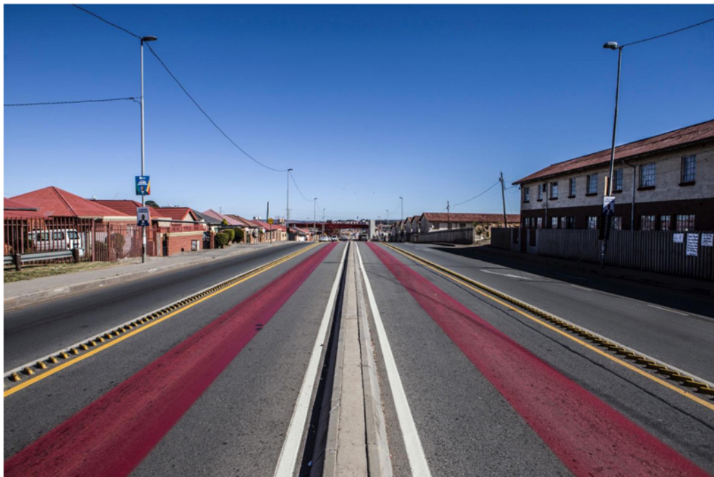
Figure 3: View of the dedicated Rea Vaya bus lane between Coronationville and Westbury along the Empire Perth Development Corridor. In different neighbourhoods where the BRT infrastructure has been rolled out, the concrete island in the middle of the road, stretching for long interrupted distances, has significantly altered mobility patterns and affected local businesses.

Committee bringing together these divided communities to develop a precinct framework through a participatory process. In this case, not only was the precinct plan not taken into account within the Corridors' planning, but the Corridor introduced a physical divide between these communities (through the development of rapid transport lanes), including making crossing the road to the local school potentially lethal (Focus group discussion, 1 June 2017). Instead of stitching together parts of the city, the project contributed to the increase of spatial and human ruptures in different segments of the Corridors (see Figure 3 ).