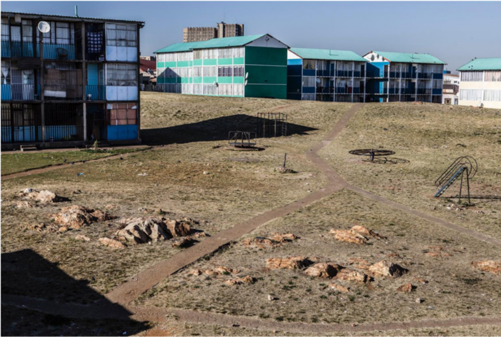
Figure 4: View of pre-existing apartment blocks in a more densely built-up part of Westbury. Within the scope of the Corridors Initiative, plans for the broader area largely focused on upgrading or building new community infrastructure such as clinics, community centres or playgrounds. During visits to the neighbourhood, residents stressed that safety was their main concern and required a more dedicated effort from the state, with gang-related violence undermining the prospect of sustainable economic activities and opportunities. PC: Mark Lewis, July 2016.

The next thing is [...] very little has been touched on in terms of cross-cutting issues; nobody spoke about the integration of schools. We are in an area where there are twelve schools within a three kilometre range. There are over 10,000 [children] in those schools, there is not one proper sports facility. (Westbury resident, focus group, 18 November 2016)