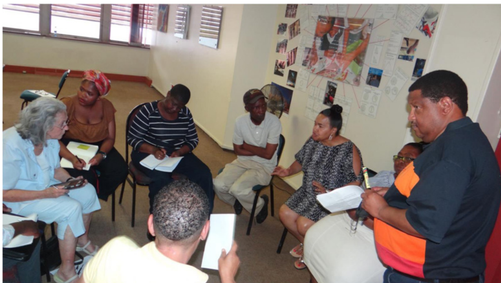
Figure 2: Snapshot of one of the breakaway focus group sessions during a cross-neighbourhood stakeholder meeting.

resources they were less dependent on organisations like Planact. For example, in Norwood/Orange Grove, the residents' associations had the capacity and legal power to lobby the City to change height restrictions of buildings. Similarly, in situations where communities are organised, the City was willing to partner and avail resources, for instance by trying to convince the leaders of the Alexandra Taxi Association to become shareholders in the BRT along the Louis Both corridor. The active Greater Sophiatown Development Forum managed to convene a public meeting and invite the JDA (Johannesburg Development Agency, the infrastructure arm of the City of Johannesburg) to come and account for the projects that were implemented in their area. Aside from these organisations that had engaged with the City and CoF, we also tried to pull in those communities and groups along the corridors that had initially been left out of the decision-making process.