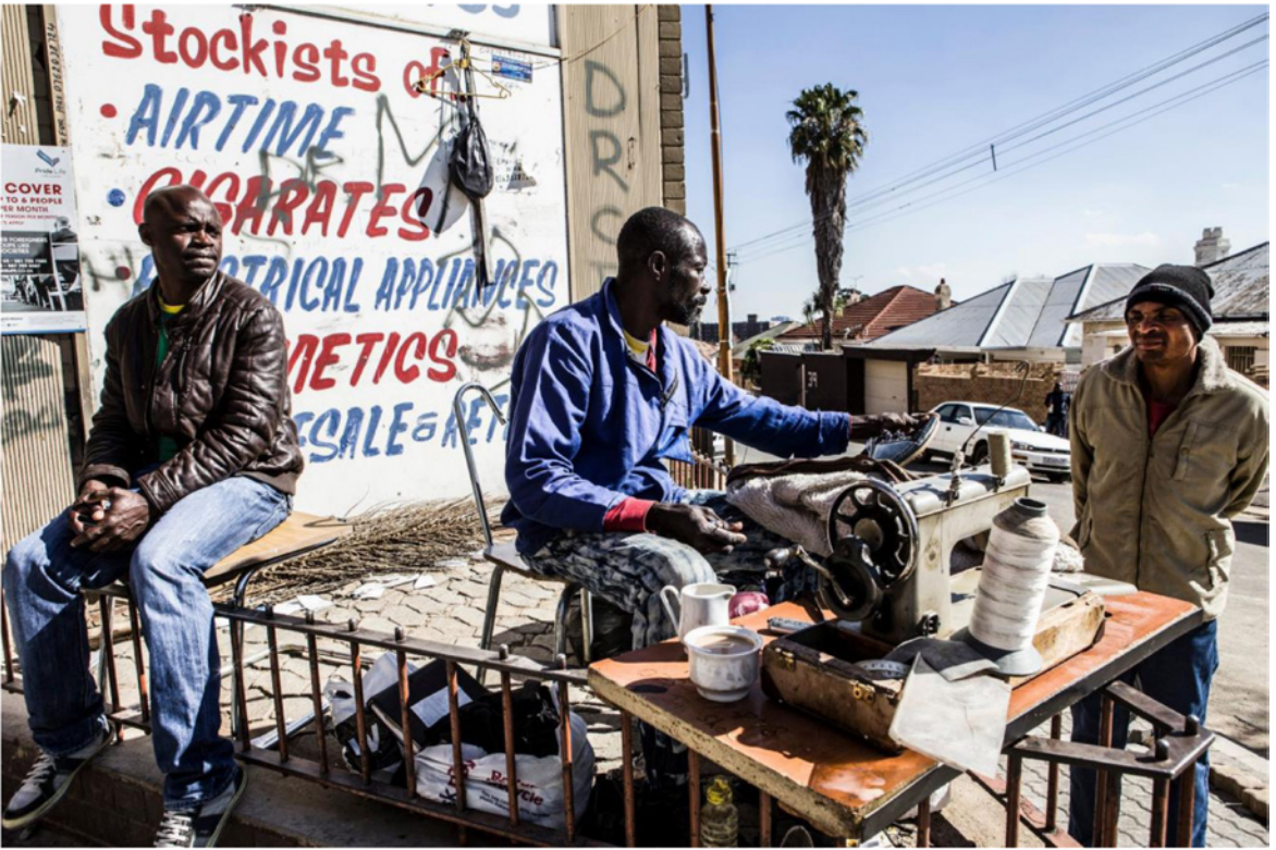
Figure 5: Small tailor business set up along Louis Botha Avenue in Orange Grove. If the Corridors Initiative was geared towards the promotion of mixed-use facilities, there was little indication about a planned integration of informal activities, raising concerns amongst affected groups.