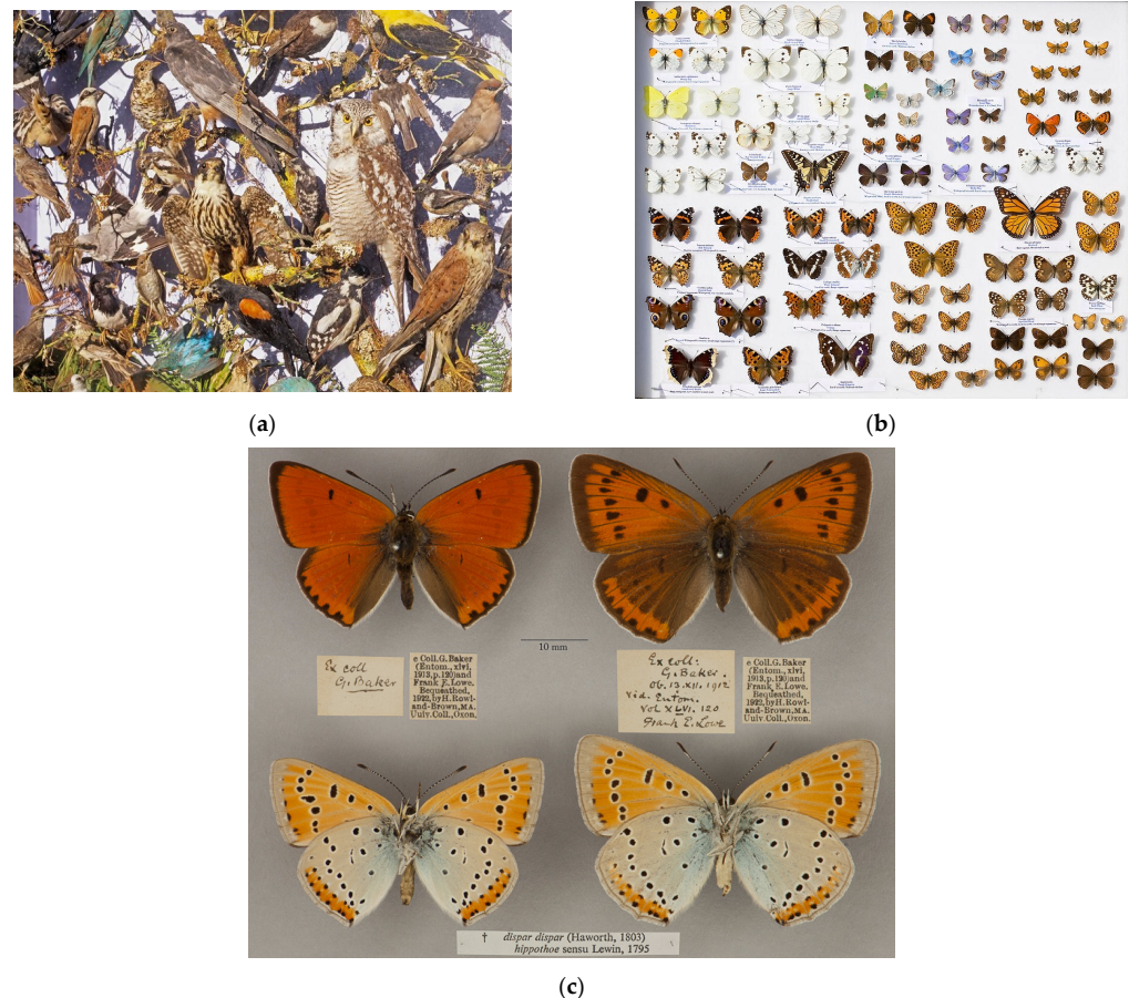
Figure 2. (a) Stuffed birds collected around Earlham in North Norfolk in the 1880s, the victims of the Victorian and Edwardian obsession with taxidermy and somehow trying to ‘own’ or at the very least ‘capture’ the essence of the natural world. (b) A collector’s case of British butterflies. There are 59 breeding butterflies in the UK and four former breeding species, as well as rare migrants such as the monarch butterfly Danaus plexippus from North America and Mexico (middle right). (c) Male and female specimens of the extinct British subspecies of the Large Copper butterfly, Lycaena dispar dispar .