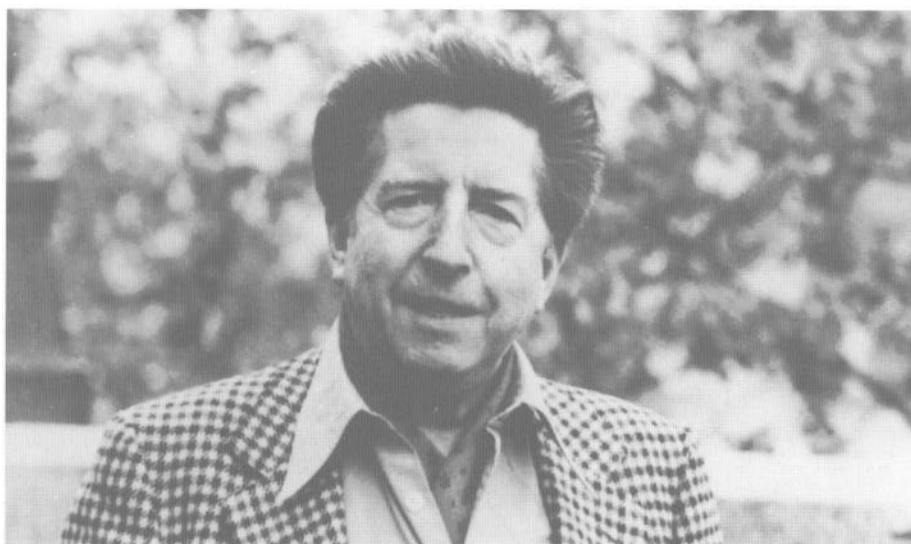
Henri Dutilleux

based on the eighteenth of Goya's etchings 'Disasters of War', and the Sonatine monodique , both for solo piano, date from this period. It was also at this time that Ohana became acquainted with André Gide who recorded their first meeting in his Journal on 17 December 1945. Ohana collaborated with Gide on the Notes sur Chopin (Paris, 1948).