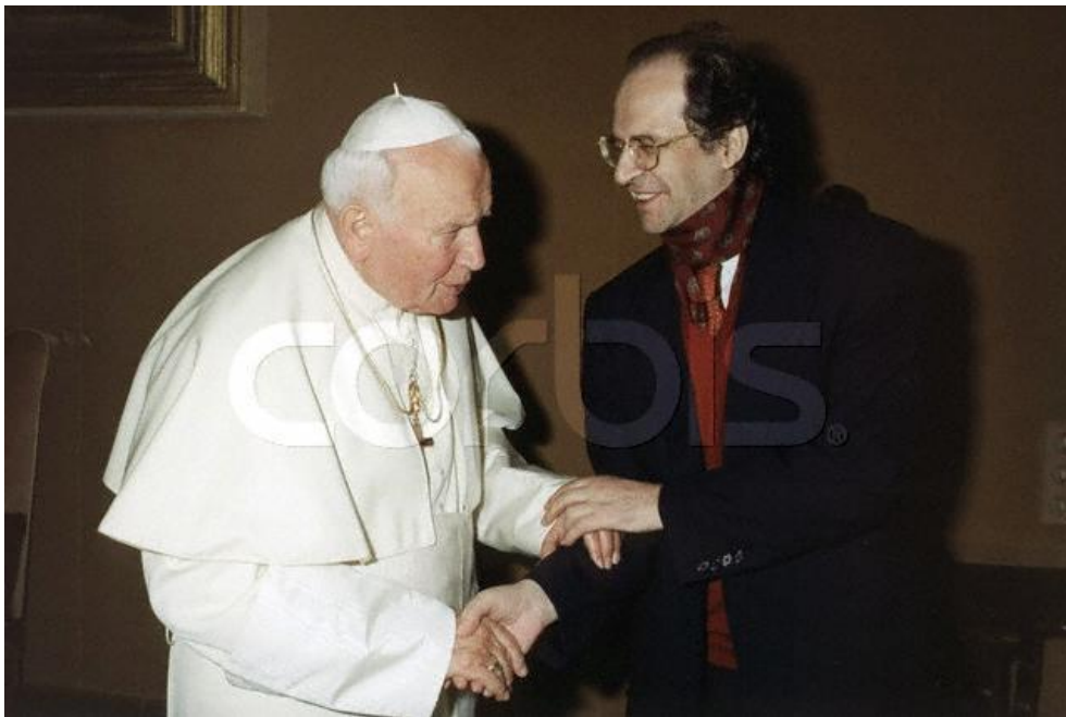
Image 7.1. Ibrahim Rugova with the Pope John II, on a visit in the Vatican during 1990s. This photo in a larger-size version continues to hang in the premises of the former LDK headquarters in Prishtina.

To-date, the photograph of Ibrahim Rugova meeting the Pope John Paul II remains as the main artefact at the former headquarters-turned-museum of the LDK in Kosovo’s capital, Prishtina. That photograph (image 7.1), taken during his first visit to the Vatican in 1992 became among the most widely used posters and – to paraphrase Barthes – visual ‘myths’ of Kosovo’s ‘Europeanised’ ethnonationalism: its dissemination in the form of cards, newspaper posters, conference placards and party gatherings made it into a graphic trade-mark of the new social practice.