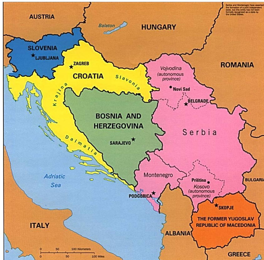
Figure 7.1. 1993: Political map, Kosovo in the former Yugoslavia (SFRY) 37

not even within the federation---while Serbs could not govern Kosovo in its entirety, although it was legally part of Serbia. Such sentiments of frustration would fuel the rise of ethnic tensions which would, in time, incite the very dissolution of the federal Yugoslavia---and the subsequent descent in armed conflict and ethnic cleansing 36 .