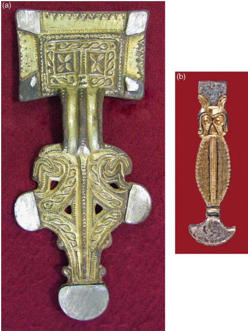
Fig 3. The Bichrome Style: (a) great square-headed brooch of the mid-sixth century from a woman's burial at Westgarth Gardens, Bury St Edmunds, grave 27; (b) pendant bridle-mount from an early sixth-century horse burial with a man at RAF Lakenheath, Eriswell, Suffolk. Scale 1:1.

indeed, only to be expected with exchanges that are fundamentally socially embedded rather than enjoying some degree of freedom to respond to market conditions. 63 In this light, it is noteworthy that Jos Bazelmans's analysis of Old English literature, especially