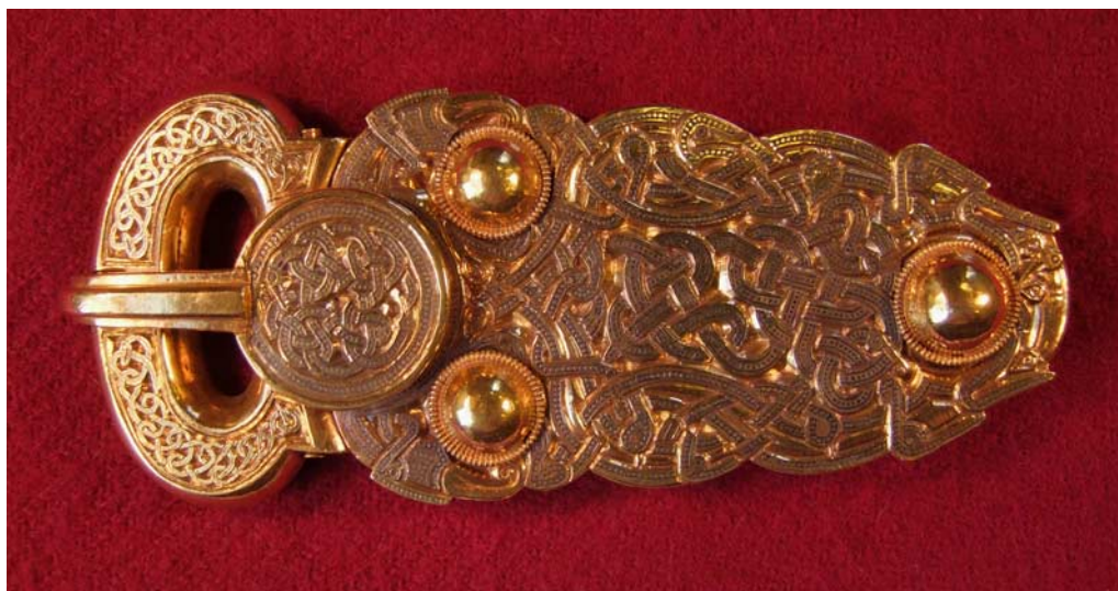
Fig 1. Sutton Hoo, Suffolk, Mound 1. The great gold buckle – the quantity in gold of a nobleman's wergild? Scale 1:1.

part of the buckle (77.7 per cent Au; 15.2 per cent Ag; 3.25 per cent Cu), 57 and its edges, exceptionally, are not neatly squared off.