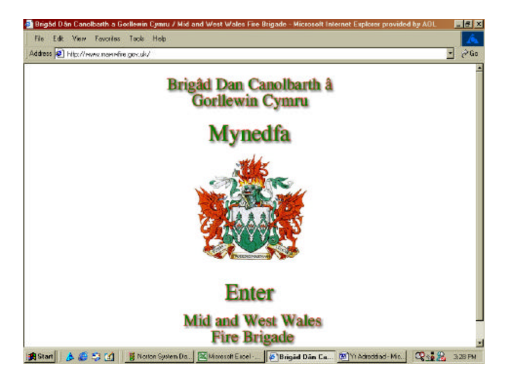
Picture 1: Mid and West Wales Fire Brigade Website. Reproduced with kind permission.

prominent place, and in the light of our research, we recommend that institutions adopt one of the following two forms of hom epage. 1) a dedicated language choice (e.g. the Welsh Language Board itself [www.bwrdd-yr-iaith.org.uk] or Mid and West Wales Fire Brigade [www.maww.fire.gov.uk]) or 2) a completely bilingual homepage, without the need for a language choice (Ceredigion County Council [www.ceredigion.gov.uk]). Institutions serving Wales which are not specifically 'Welsh' organisations, e.g. Government agencies in Whitehall may note that these options are not practical for them, as not all of their functions are relevant to Wales. In the case of such agencies, we recommend the use of a prominent Welsh language choice on the home page.