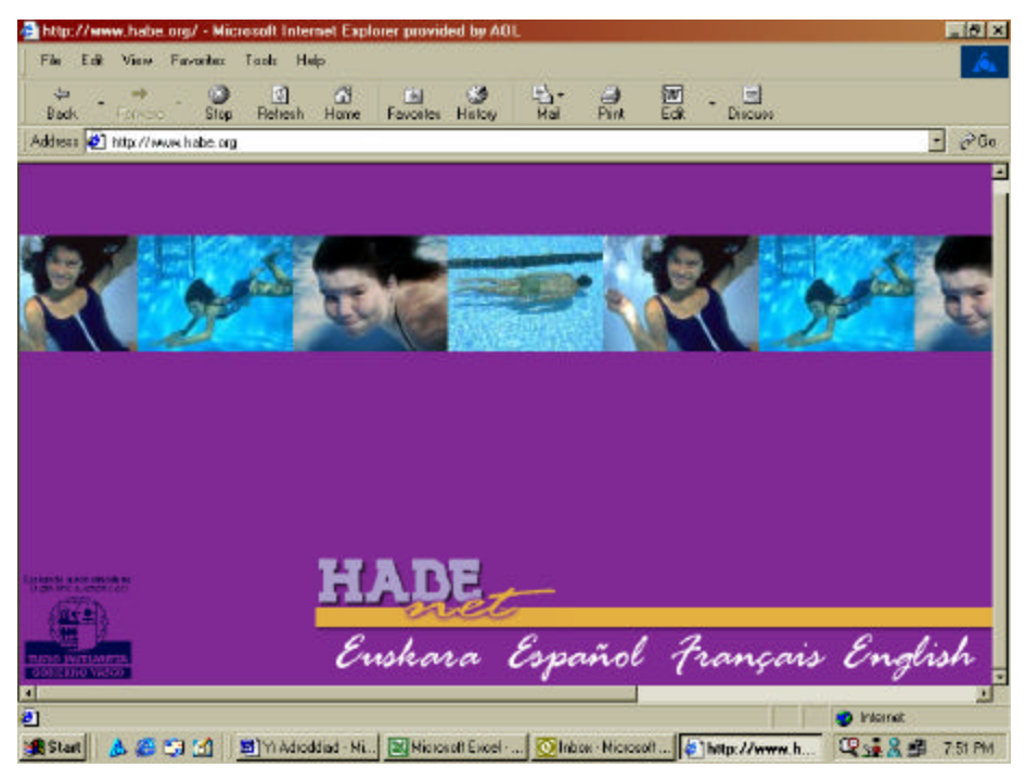
Picture 4: Convenient multilingual choices on a website (www.habe.org)

Firstly, it should be noted that bilingualism should be a central concern in the process of designing websites serving the public in Wales. It is evident, after reading many sites for this snapshot survey, that this is not the case at present. On the homepage a language choice should be offered in a totally clear fashion, either by making this the main purpose of the page, or by a thoroughly bilingual page (our two preferred options), or a monolingual page offering a language choice via a button. Illustrated below is a site that offers a choice of 5 languages in a completely obvious way.