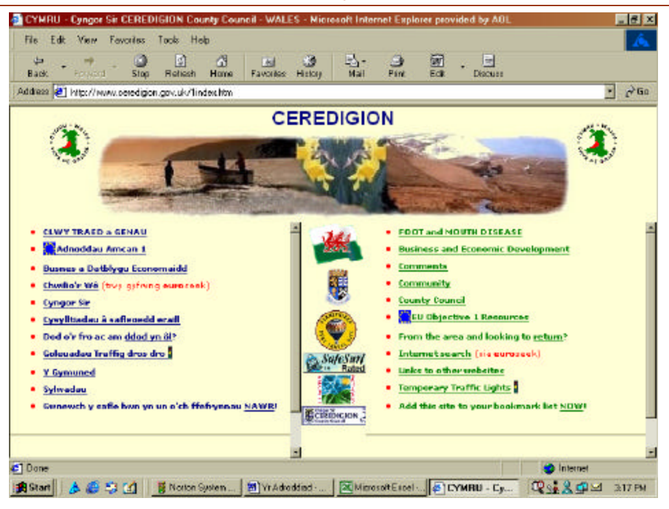
Picture 2: Ceredigion County Council website Reproduced with kind permission.