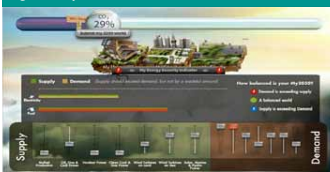
Figure 2. My2050 Scenario Tool

It is possible to ask multiple different questions of data in the analytic process. The questions that have been asked for the analysis reported here are not exhaustive but were derived from academic literature, policy consultation, expert interviews and through input from our advisory panel (see appendix). Additionally, emergent concerns that arose through discussion and appeared as particularly salient for members of the public were treated to analytic scrutiny. It is important to highlight that this form of research and analysis allows for insights into the values and concerns that underlay expressed preferences.