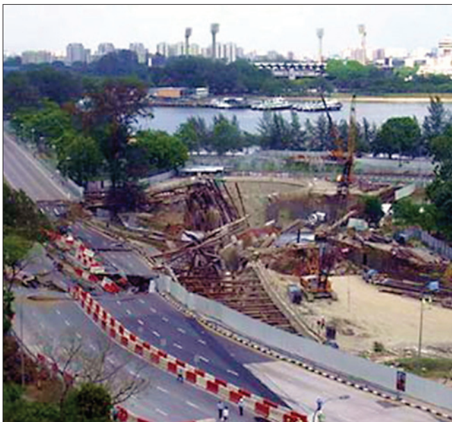
Figure 5. Retaining wall collapse at Nicoll Highway, Singapore in 2004 during construction of the mass rapid transit – investigations suggested the most likely cause lay in the design of the retaining wall, which proved insufficient to resist the earth pressure. This was attributed to the use of an inappropriate soil model, which overestimated the soil strength at the site and underestimated the forces on the retaining walls in the excavation

Guidance documents are essential for improving analysis approaches. Examples include European guidance on flood mapping good practice (Martini and Loat, 2007), a validation framework for flood modelling (Wicks and Horritt, 2012) and a framework for assessing uncertainty in flood risk mapping (Beven et al. , 2010). A significant contribution to benchmarking of two-dimensional flood models is provided by the UK Environment Agency (Néelz and Pender, 2010).