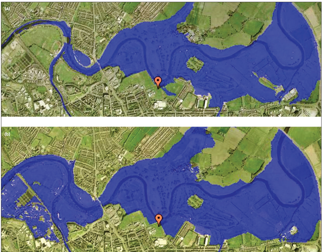
Figure 4. Flood extent maps illustrating the likelihood of 1:100 year flood extent for Carlisle, England: (a) 50% likelihood; (b) 96% likelihood. The maps illustrate the application of a probabilistic approach to the understanding of flood extent (courtesy University of Lancaster / Flood Risk Management Research Consortium, www.lancs.ac.uk/staff/leedald/Carlisle/visualisation.html ).

In both cases there is also a likelihood that the flooding could be outside the blue area. The difference between the maps is not due to any errors in the processing, which involved 3000 different simulations taking account of various input data uncertainties and the influence of the tributaries. In this case, there is no uniquely correct flood map. Instead, the probabilistic approach to the analysis gives useful information to decision makers.