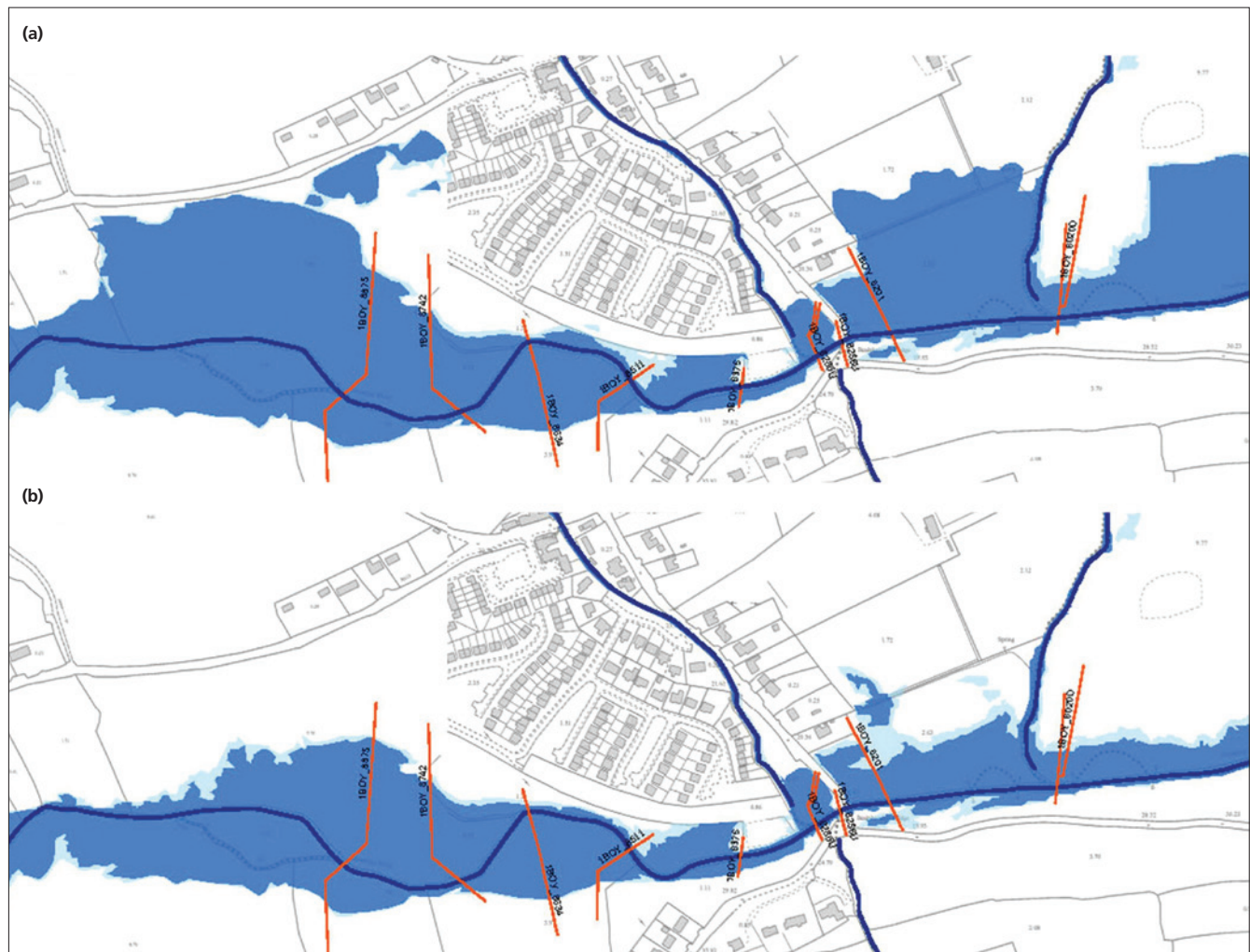
Figure 3. Example flood mapping problem: (a) incorrect post-processing due to a user incorrectly applying geographic information system analysis to determine the water surface predicted by a one-dimensional hydraulic model by intersection with a digital terrain model; (b) corrected post-processing when the user excluded the overlaying of water levels from tributaries on the primary river floodwater surface elevations – the problem was not straightforward to identify due to a lack of validation data

Flood modelling underpins modern flood risk management. Flood maps are used to locate new developments away from flood-prone areas, to enhance emergency planning procedures, to carry out economic appraisal of different flood-management options, to raise public awareness and to provide information for insurance purposes.