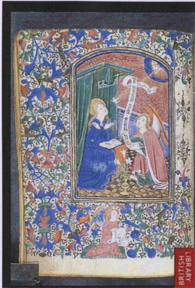
Fig. 6 - The Annunciation at the beginning of Matins in the Hours of the Virgin, London, The British Library, MS Harley 2884, fol. 22v. < http://www.bl.uk/catalogues/illuminatedmanuscripts/ILLUMIN.ASP?Size=mid&IllID=20714 > [accessed 21 st March 2009]