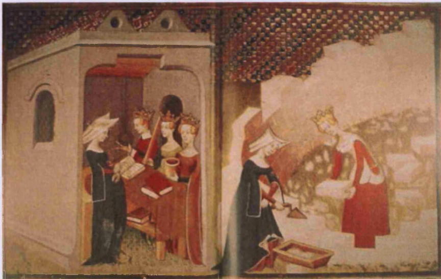
Fig. 4 - Christine and Reason begin to build the wall of the city, Le Livre de la Cité des dames , London, British Library, MS Harley, 4431, fol. 290, from Susan Groag Bell, 'Christine de Pizan in her study', Cahiers de recherches médiévales et humanistes , Études christiniennes, 2008, mis en ligne le 10 juin 2008 < http://crm.revues.org/index3212.html > [accessed 11 th May 2009]