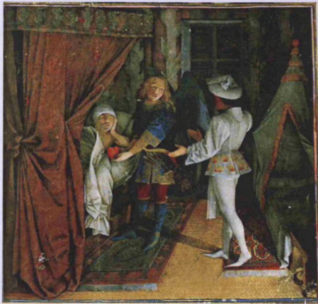
Fig. 2 - Le Livre du cuer d'amours espris , Vienna, Austrian National Library, Codex Vindobonensis 2597, fol. 2, c. 1457 < http://www.guice.org/bklvf-02.html > [accessed 7th June 2010]