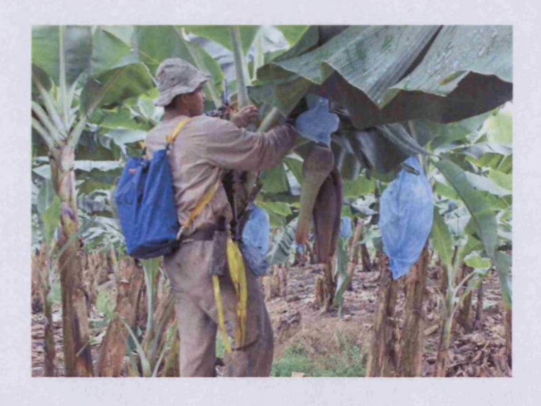
Plate 7.1 A worker positioning a blue bag around the bud of a banana plant