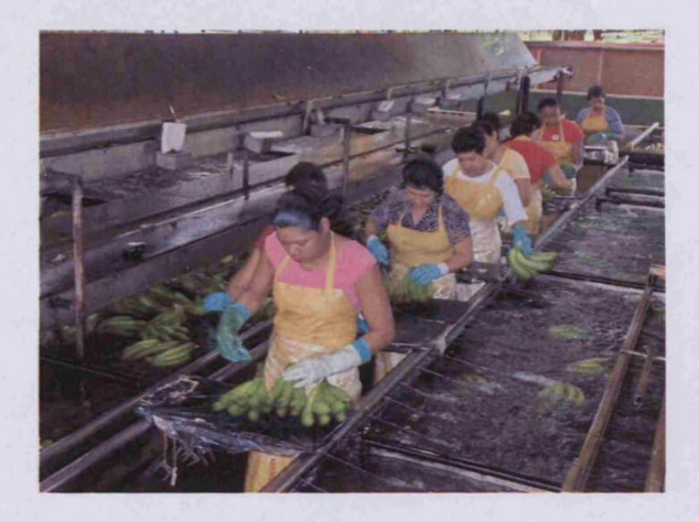
Plate 7.4 A group of selectors trimming bunches of bananas