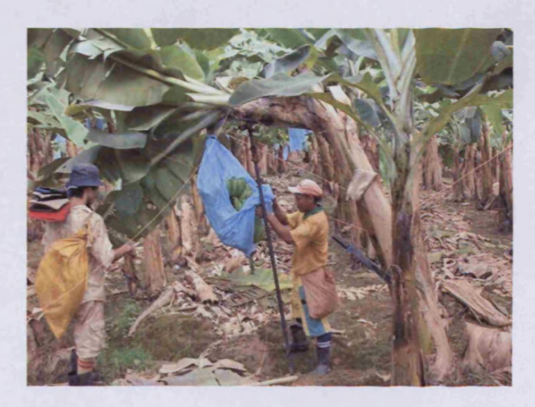
Plate 7.2 A harvest team preparing to cut the fruit