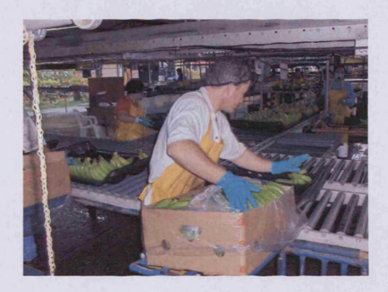
Plate 7.5 A packer placing bunches of bananas in a box ready for shipping