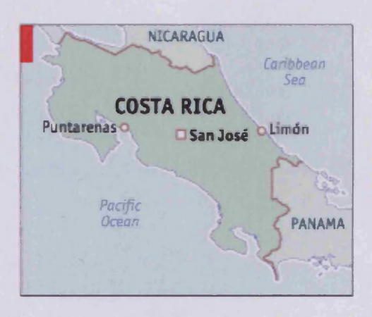
Figure 5.1 Map of the Republic of Costa Rica