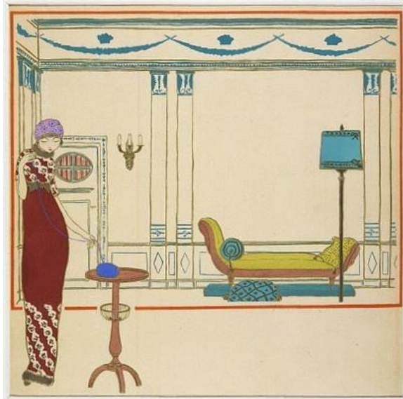
Fig. 2. Georges Lepape. “Design for a high-waisted dark red dress”. In Les Choses de Paul Poiret vues par Georges Lepape . April 1911. Callotype, letterpress, line block and stencil. Victoria and Albert Museum, London.