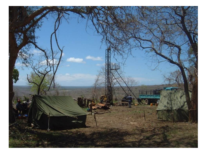
Figure 4. One of 40 shallow penetration boreholes drilled by the Tanzania Drilling Project (2002–2009). This is TDP site 12, the proposed TOPIC drill site (see Fig. 1 for location).

to engage with a cutting-edge science project and international scientists from many countries. We discussed ways of funding master's projects and involving students on site, possibly with an ICDP training course.