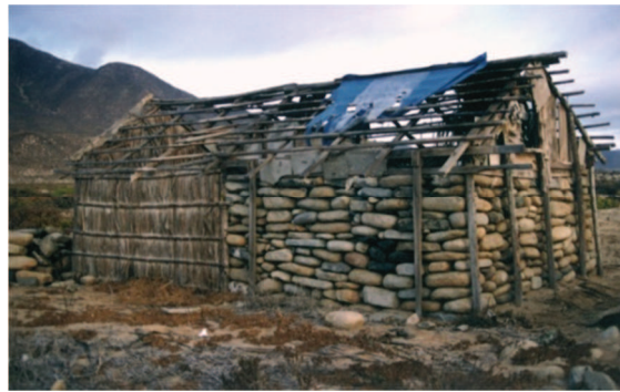
Figure 2. Fishermen's shelter near Carrizal Bajo.

In the second half of the nineteenth century European immigrants arrived in the region drawn by the mining opportunities and the construction of Chile's first railway linking the mining town of Copiapó to the port of Caldera. With them they brought an architecture of timber framed, timber clad houses, many prefabricated in North America. As a local adaption, the walls of these timber houses were infilled with a quincha (wattle and daub) a traditional local building technique consisting of a background of branches or split bamboos covered with an earthen render reinforced with straw. A notable example of this type of architecture is the Casa Tornini in Caldera (fig. 3).