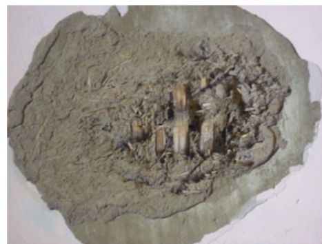
Figure 4: Detail of quincha wall build-up.