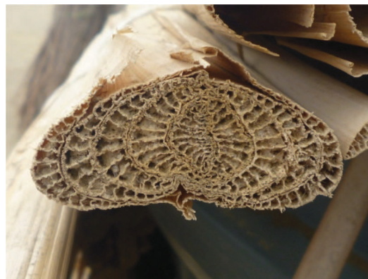
Figure 5: Totora beds in the River Copiapó estuary. Figure 6: Cut totora stem showing cellular structure.

This cellular structure gives the stems a good insulating quality with a coefficient of thermal conductivity \lambda calculated by the University of Minnesota as being 0,069W/mK (Niaquispe-Romero et al. 2011). The reed is traditionally used for roofing, wall coverings and windbreaks. For roofing the stems are doubled around horizontal timber roof poles and stitched together below the pole to secure. In modern application, a sheet of bituminous roofing felt is sometimes sandwiched between the doubled-over stems to provide greater water-tightness. For wall applications and windbreaks the stems were traditionally laid side by side and sandwiched between vertical branches or bamboo canes. A contemporary development of this technique uses lines of stitching running perpendicular to the stems to create mats that can then be applied to timber uprights. Given its coefficient of thermal conductivity the recommended U-value of 0.8W/m 2 K for roofs (Russo et al. 2008) could be achieved with a thickness of 75mm and for walls 0.9W/m 2 K with 65mm.