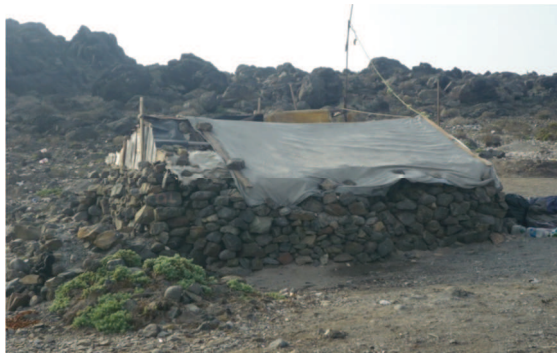
Figure 1. Fishermen's shelter, Piedras Bayas.

The indigenous people of the region now known as Changos , according to the local museum of Caldera, inhabited shelters composed of semi-conical structures of branches covered with grasses and seal skins, with a low base of dry stone walls. Similar structures can still be encountered today along the coast, used by the descendants of these people as either temporary or permanent shelters (figs 1 & 2). The low stone walls provide shelter from the coastal breezes and may offer some thermal inertia to provide comfort during the cooler nights and mornings.