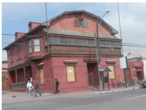
Figure 3: Casa Tornini, built circa 1860, Caldera .

In the second half of the nineteenth century European immigrants arrived in the region drawn by the mining opportunities and the construction of Chile's first railway linking the mining town of Copiapó to the port of Caldera. With them they brought an architecture of timber framed, timber clad houses, many prefabricated in North America. As a local adaption, the walls of these timber houses were infilled with a quincha (wattle and daub) a traditional local building technique consisting of a background of branches or split bamboos covered with an earthen render reinforced with straw. A notable example of this type of architecture is the Casa Tornini in Caldera (fig. 3).