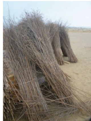
Figure 8: Bundles of harvested brea