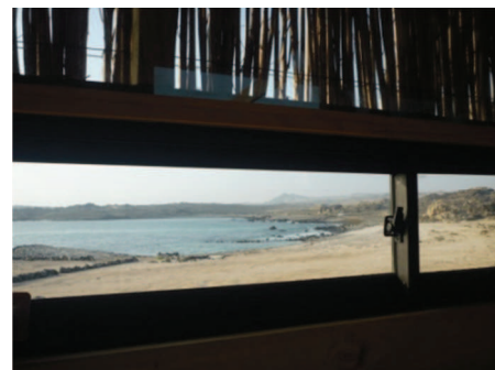
Figure 11: Bathroom and offices, Base Camp, piedras Bayas. Figure 12: View out showing brea cladding