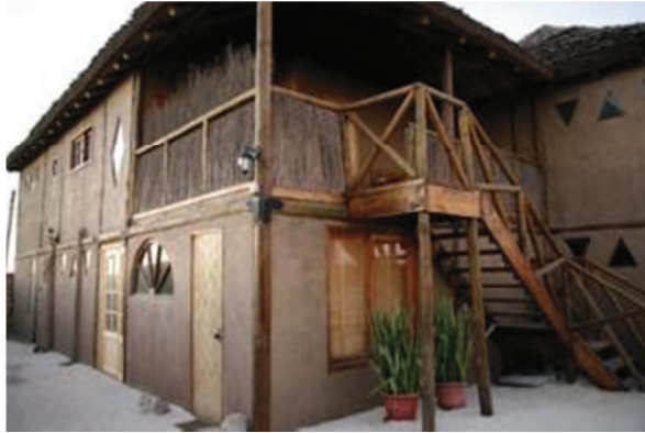
Figure 9: Hostal Boutique Ckamur, Caldera .