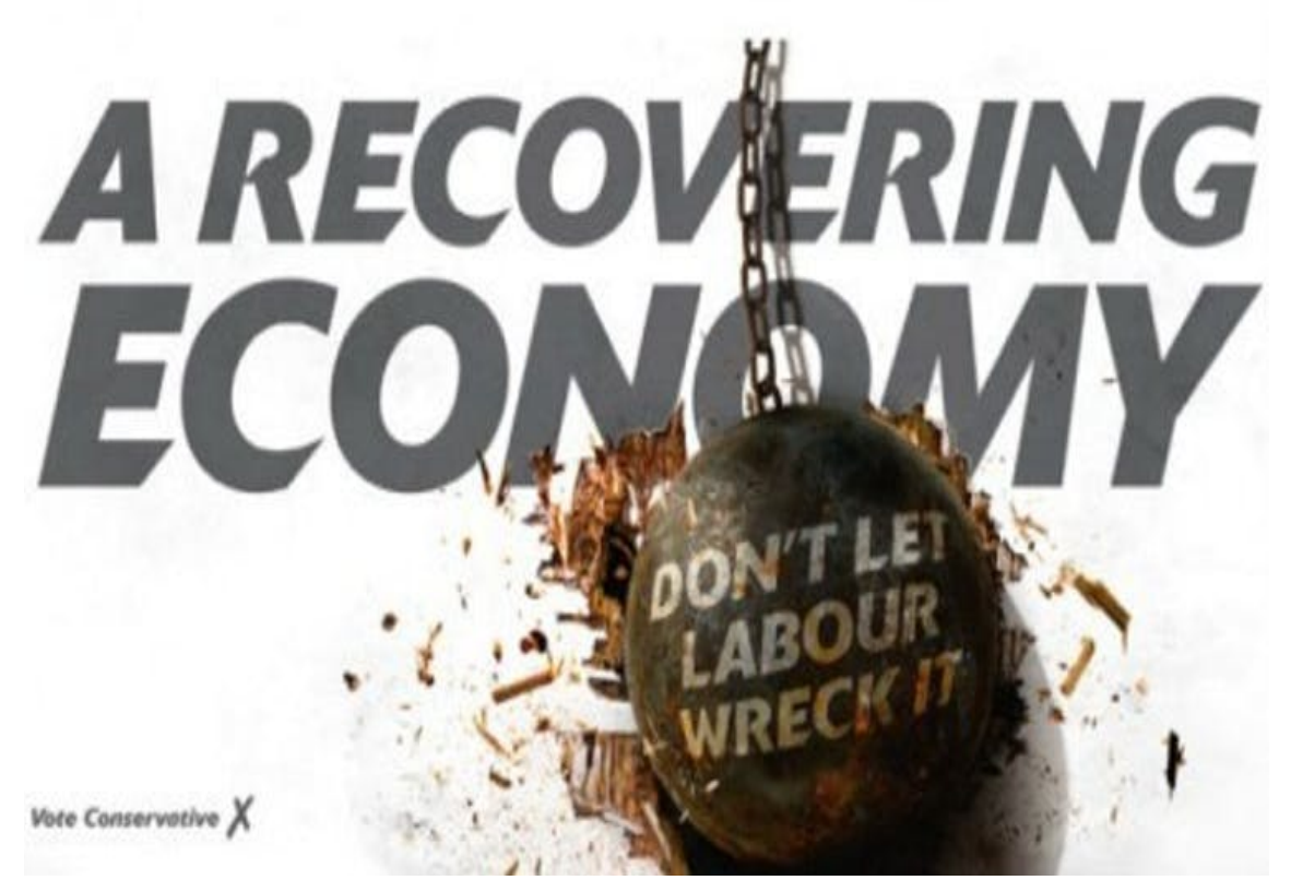
Can you feel the fear?

Many have pointed out that these are classic pieces of attack of attack advertising. Sebastian Payne in The Spectator got it spot on when he wrote that it: "suggests that the Tories are less interested in bigging up their own brand than they are in terrifying voters about the prospect of a Miliband government".