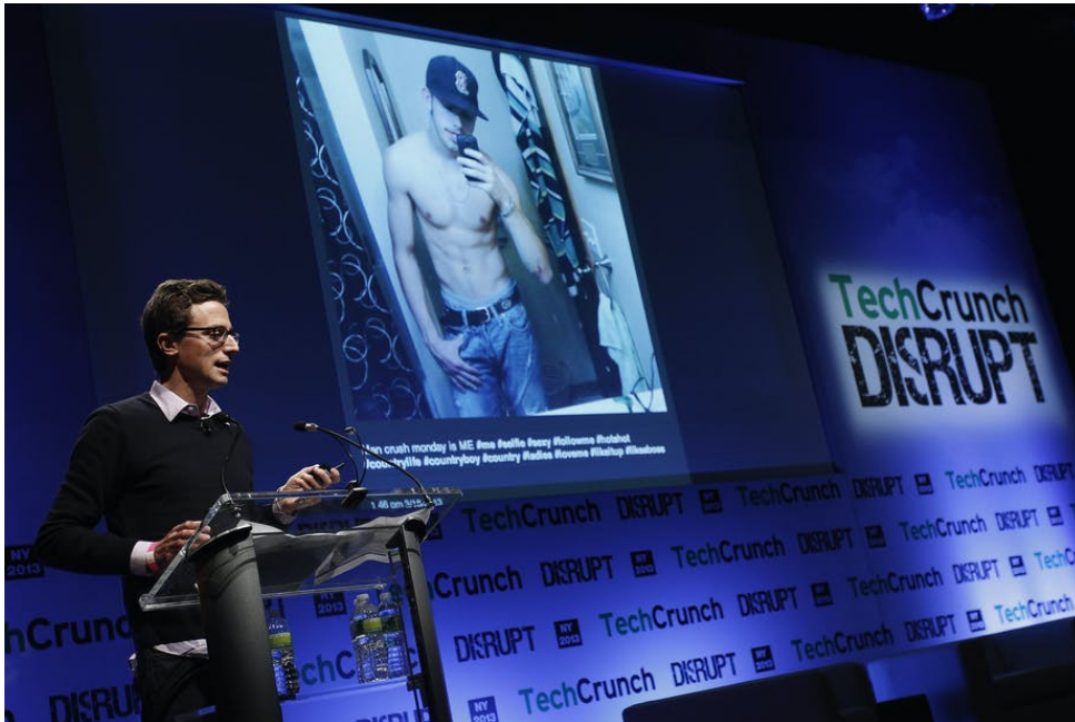
Jonah Peretti of BuzzFeed at the TechCrunch conference Disrupt NY 2013.