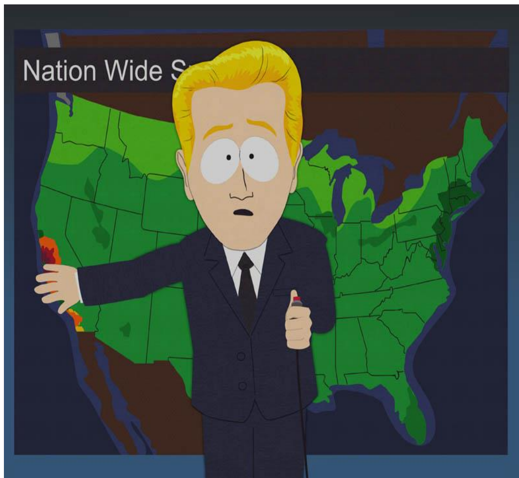
The smug heads for South Park: panic as San Francisco's smug problem escalates.

After the family leave, the sad and lonely best friend of Gerald's son decides to pen a song praising the virtues of electric vehicles. Kyle supposes that, if everyone in South Park abandons internal combustion engines, Gerald will return with his son in tow. The song is broadcast on a local radio station where its central message proves to be so powerful that it convinces everyone in town to drive hybrids. On his way home from the radio station, the boy meets Ranger McFriendly, local protector of the environment, who, with great concern, explains the disastrous consequences of his actions. While emission levels from internal combustion engine car exhausts have fallen, they have been replaced by a new pollutant – this time borne of the 'self-satisfied garbage' spewed by the drivers of hybrid cars.