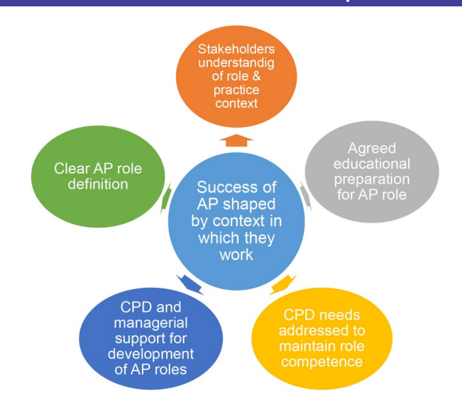
Figure 2 Factors identified by all professional groups that would enhance the success of advanced practice roles. AP, advanced practitioners.

The ideal advanced practitioner of the future, as envisaged by study participants, would therefore consist of a