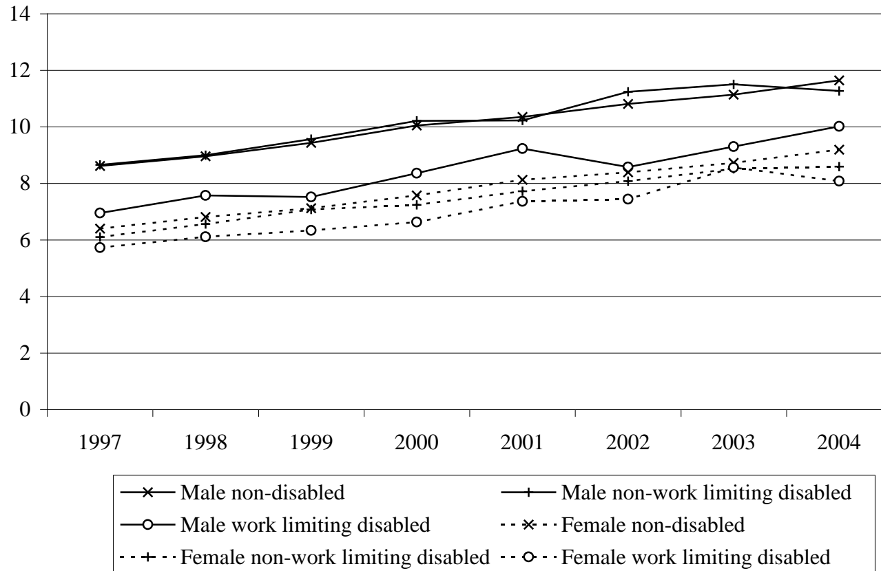
Fig. 2. Average hourly pay in Great Britain 1997-2004

Source: Authors' calculations based on UK LFS, Summer quarter.