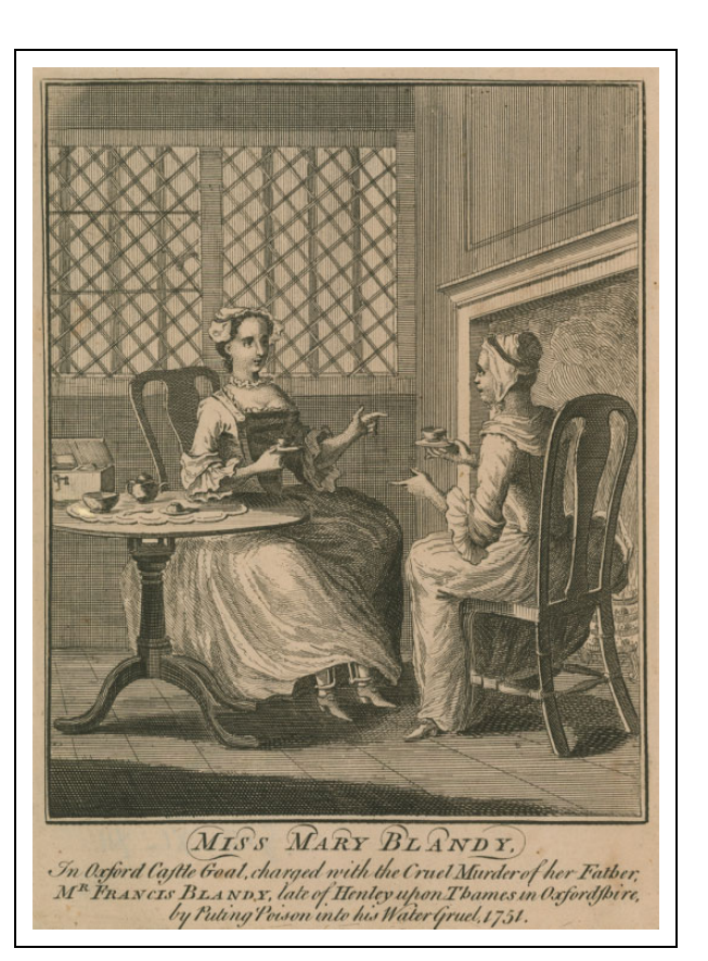
Figure 2. "Miss Mary Blandy, 1751". Engraving. Source.