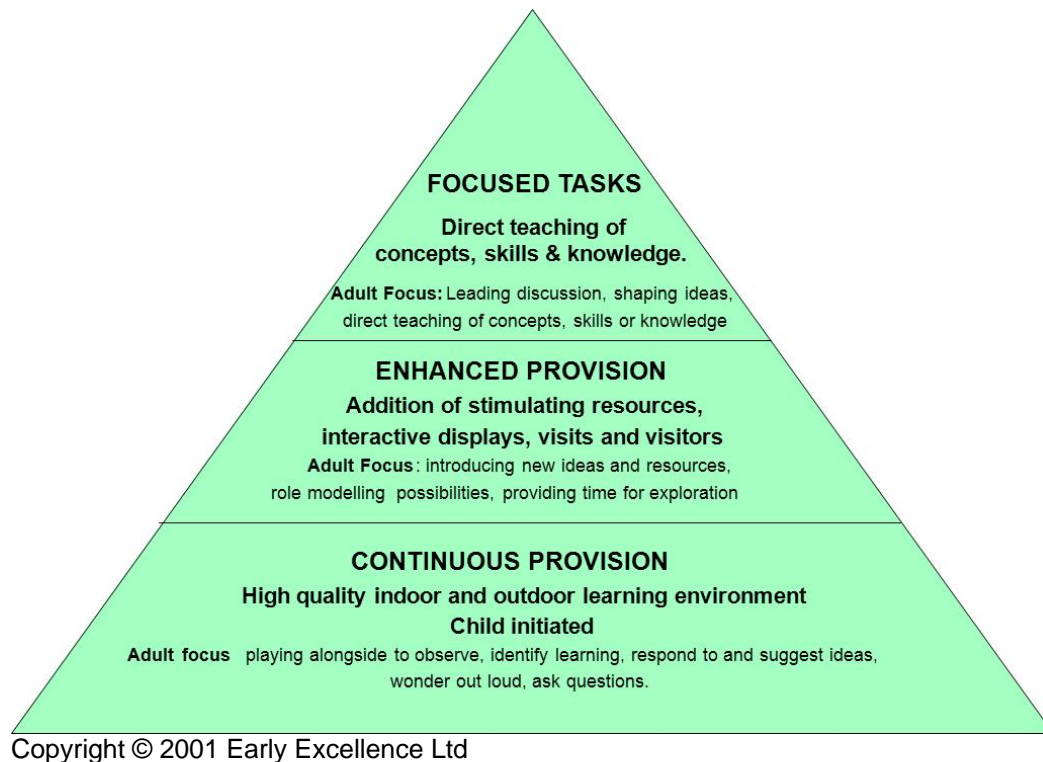
Figure 4: Curriculum Development Model (ELP Powerpoint Slide 93)

4.33 The term ‘child-initiated’ may therefore relate to what within this Training Pack is termed ‘continuous provision’ – where children ‘spontaneously’ play with (structured) resources that have planned learning objectives – while ‘structured play opportunities’ (structured educational play), planned in response to cues from children (L&T