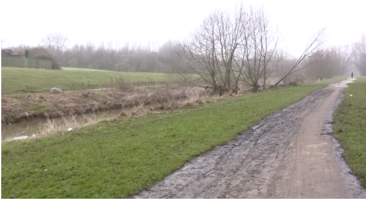
Figure 5. Bankside and river channel after winter cutback.