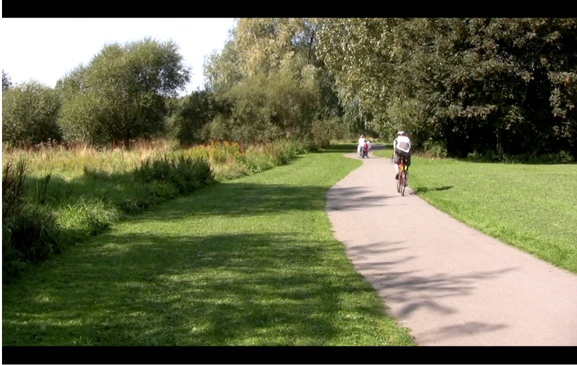
Figure 4. Bitumen cycle and walking path tracing the contours of the new river channel meanders.