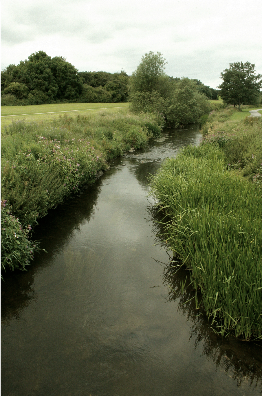
Figure 2. A view of the restored River Skerne. Note the designed aquatic ledge within the channel in the foreground on the right, a self-rooted willow downstream (likely derived from a willow revetment), and the general re-shaping and planting of the channel as compared to the pre-restoration image of section 6 in Figure 1(f).