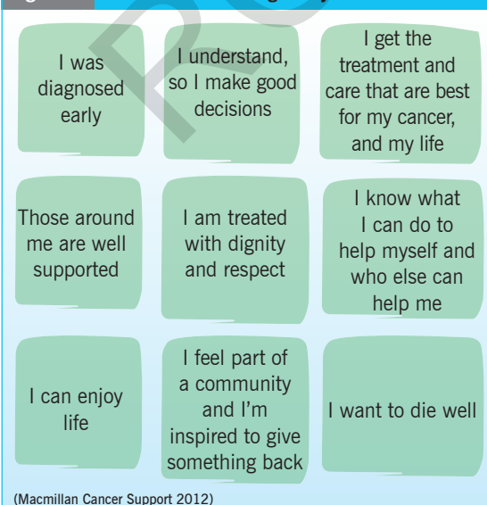
Figure 1 Nine statement targets by 2030