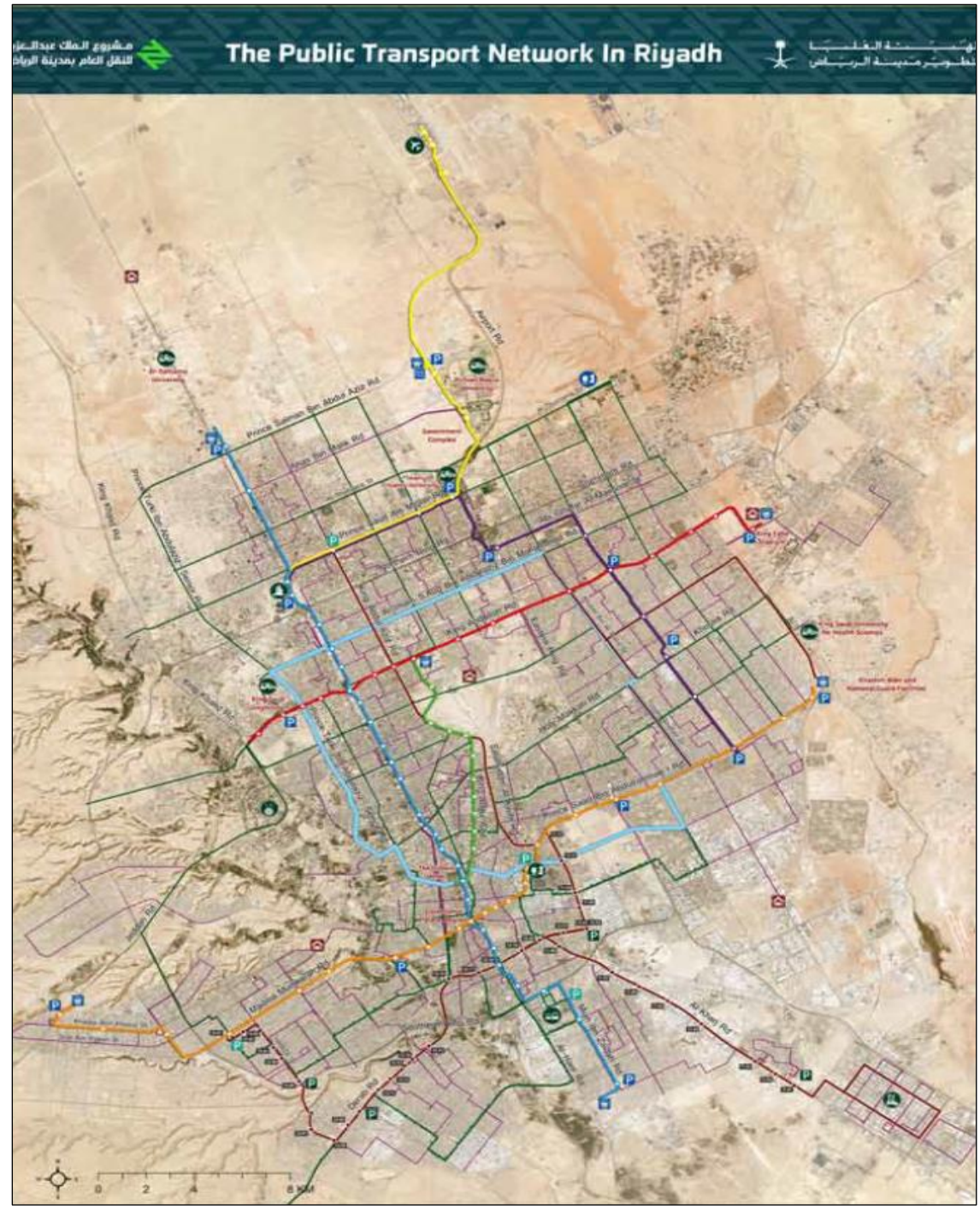
Figure 1. The public transport network in Riyadh City