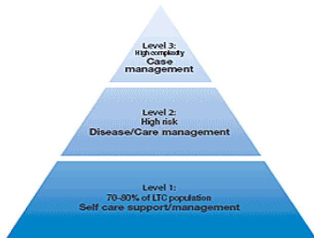
Figure 1 Kaiser Permanente triangle

The term 'case management', with its roots in social care, was developed as a method of delivering holistic individualised care, tailored to the needs of people with complex health and social care problems (Hutt et al 2004 p.6). Initially instigated in the 1950's to provide care to patients with severe mental health problems, it was expanded for use with older people with complex health and social care needs, to both contain health care costs and co-ordinate services thus reducing the need for institutional care (Drennan and Goodman 2004, Hutt et al 2004). The Kaiser Permanente triangle, on which a number of LTC Models have been based, including the DH (2005) NHS and Social Care Long Term Conditions model, is well known. It consists of a three-tier triangle approach, stratifying patients in order to match them to appropriate packages of care, as shown in Figure 1: