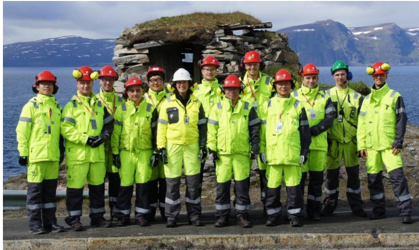
Fig. 7. Group picture at Melkøya after LNG site visit.

afternoon from Tromsø airport, the group was looking forward to get to know the north.