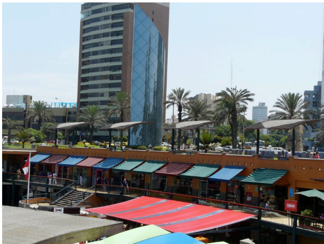
Figure 2. Larcomar shopping centre in Miraflores

Notwithstanding investments in the modernization of affluent areas, for those living in the barriadas and other peripheral neighbourhoods access to public services and a reasonable quality of life still remained a daily problem at the end of the Fujimori administration (Joseph, 2005). According to SASE (2002), only 11% of the settlements regularized by COFOPRI in 2001 had acceptable standards of public services (i.e., water, sanitation, telephone, streets and housing construction material). Parks and recreation areas were progressively privatized, in tandem with restrictions in the access of low-income people to shopping centres (essentially through ‘face-control’ and the exclusion of suspicious mestizos) (Plyushteva, 2009). Urban violence became an ever more serious issue; between 2000 and 2011 the rate of crimes increased by 80% in Lima, while kidnaps increased by 196% and homicides by 233% (according to the Observatory of Criminality of the Attorney General’s office. 5 Instead of isolated problems, those circumstances were associated with the economy’s neoliberalization and deteriorating income levels of Lima’s workforce in Lima between 1987 and 2002, especially among non-unionized, informal workers (Verdera, 2007).