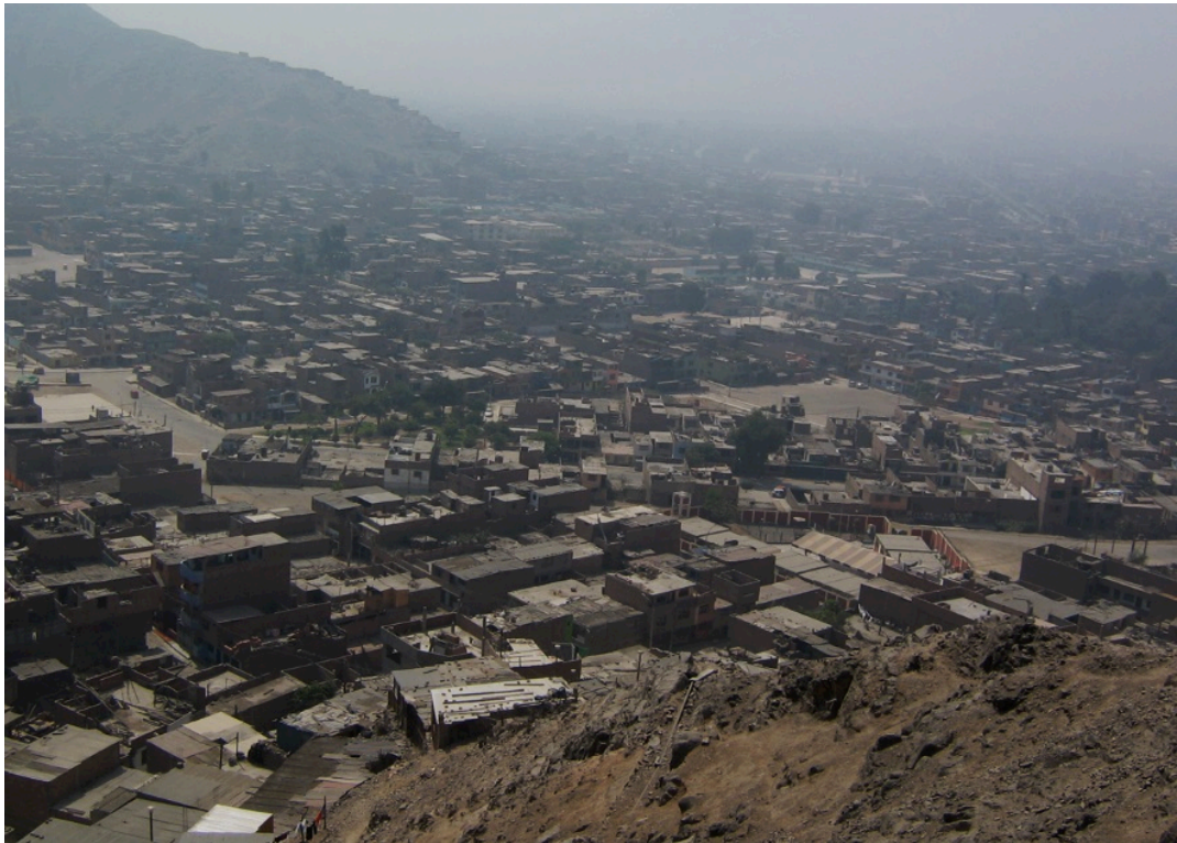
Figure 1. Overview of the periphery of Lima