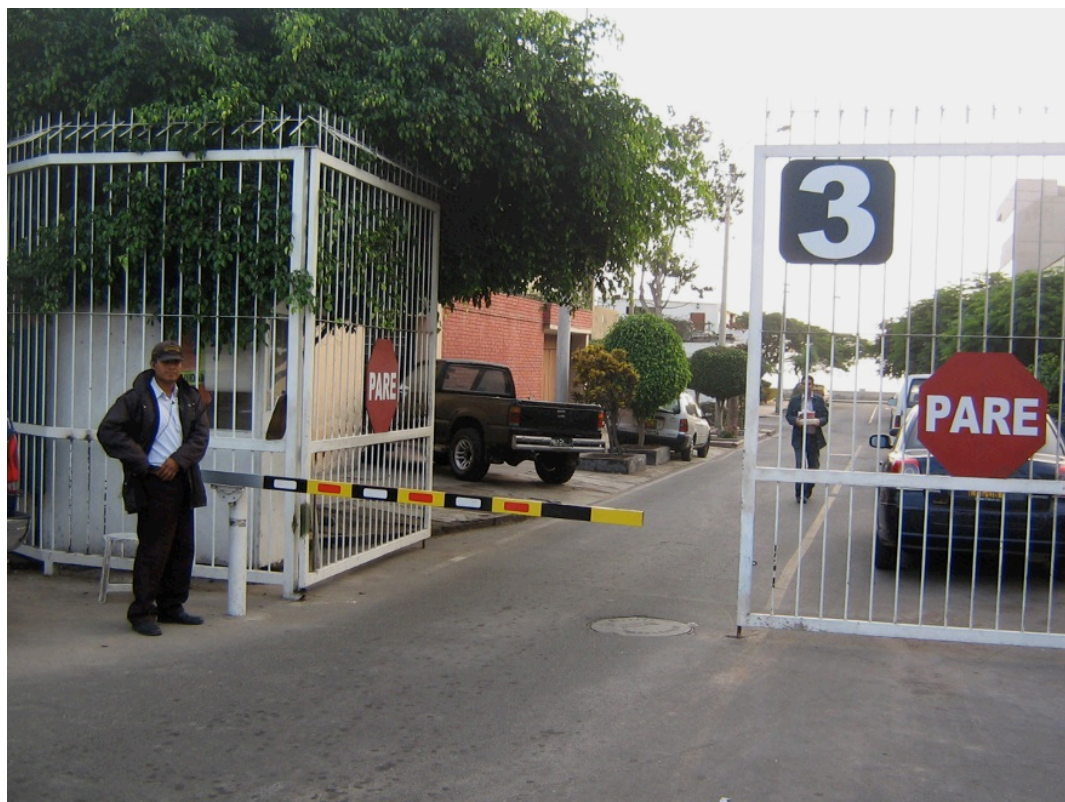
Figure 3. Gated Communities in the municipality of Chorrillos, an increasingly common feature of Lima

After the turbulent political transition that followed the unforeseen resignation of Fujimori (caused by devastating evidence of large-scale and systematic corruption), a new president – US trained economist Alejandro Toledo (2001-2006) – came to office promising to overcome the political and economic shortcomings of the previous governments, which had left the capital fraught with institutional uncertainties, poor policy coordination and deteriorating environmental conditions. In 2006, under Toledo's instructions, the public fund MiVivienda started to finance the purchase, improvement and construction of popular households. Other projects and plans were also launched with the purpose of alleviating the housing deficit (e.g., Techo Propio, Bono Familiar Habitacional). However, the perverse side of those initiatives was over reliance on the private sector for the construction of new housing units, while the state largely withdrew from direct construction interventions. Under free market competition, builders showed a preference for middle class residences instead of less profitable units for the low-income population (interview, national government policy-maker, May 17, 2009). In governance terms, decentralization and democratization only marginally improved in Lima, because national government authorities retained a firm control over decisions and resources (Dietz and Tanaka, 2002).