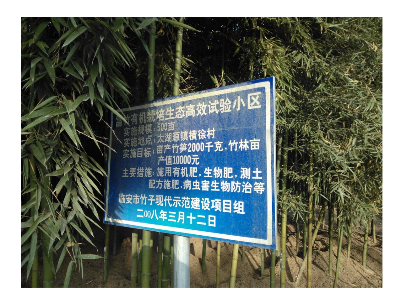
Figure 3 Sign showing the adoption of hazard-free and Zhejiang forest food production base standard