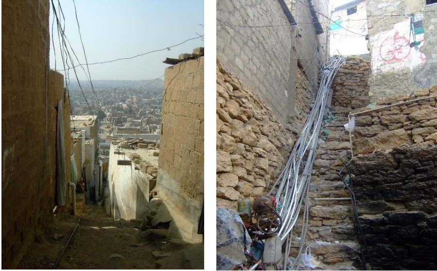
Figures 3: Winding street pattern and illicit water and electricity connections in Chamra Chum, North Nazimabad

In the informal areas, especially on the hill, the electricity company representatives did not repair faults or disconnect illegal connections because of the difficult terrain and threats to company employees. Thus, most residents on the hill had illegal electricity connections and did not pay their bills. To recover the costs of illegal connections, the company distributed the cost of power losses to all paying customers.