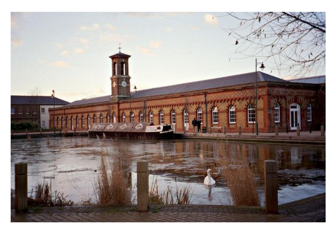
Fig. 1. Royal Small Arms Factory machine shop (Matthews, 2000).