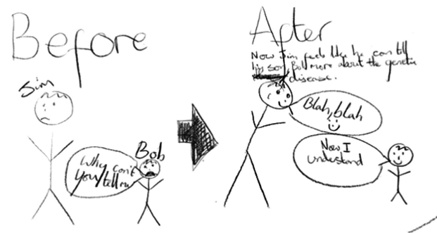
Figure 2 A picture showing a family before and after attending the MFDG intervention. In the before image the child is sad and confused asking their parent "why can't you tell me?" In the after picture the child is happier because he understands what is happening in his family because his parents have been 'able to tell his son a bit more about the genetic disease'.

Logistical challenges such as travel costs and/or child care costs were also seen as a barrier for some families' participation. The most prevalent barrier to attending the MFDG however were parents' anxieties surrounding children's exposure to other IGCs. Parents