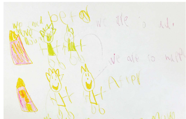
Figure 3 A picture showing the child's family before and after the intervention. In the before picture, the child has written by an image of his home 'we are so sad' and in the after picture the child has written 'we are so happy'.

perceived that being exposed to families with children affected by life-limiting conditions would upset their children.