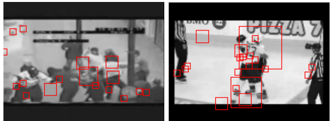
Figure 1. These are local response regions resulting from our process when applied to a sample from the Violent Flows dataset, and the Hockey violence dataset.

for each type of data by placing the values into 20 uniformly spaced bins before applying L_2 normalization. Figure 1 shows the locally responsive regions that are detected in scenes taken from the Hockey violence and Violent Flows datasets.