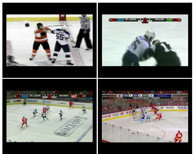
Figure 2. Example frames taken from the Hockey Violence dataset.

The hockey violence dataset consists of 1000, 50 frame length videos recorded at 25 frames per second at a resolution of 720 \times 576 . This dataset displays one-on-one violence between two ice hockey players and footage of standard play. Due to the nature of the sport, the violent acts depicted contain only upper body violence such as punching and pushing. Figure 2 shows examples of the type of footage seen in the hockey violence dataset.