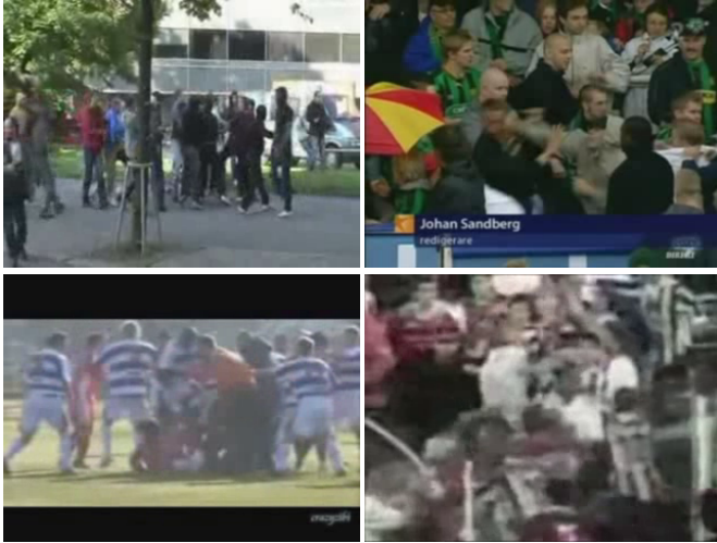
Figure 3. Example frames taken from the Violent Flows crowd violence dataset.

depicting violent and non-violence crowded scenes, and was downloaded from YouTube. Given that all of these videos originate from different sources, they all show different characteristics based not just on crowd behaviour, but also in camera quality and the compression methods applied before being uploaded online. Figure 3 shows samples from the Violent Flows dataset.