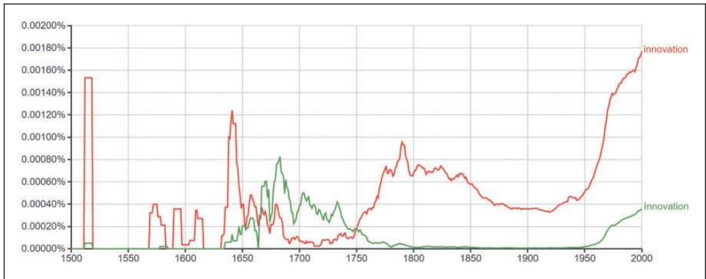
Figure 2. Use of the term 'innovation' since 1500.

Source: Ngram Viewer (2017) – The Google Ngram Viewer uses its digital database to measure the amount of times that 'social innovation' appears in English books published in the United States, relative to other bigrams. It is therefore not an indication of the absolute use of this concept, but of relative use. More information here: books.google.com/ngrams/info .