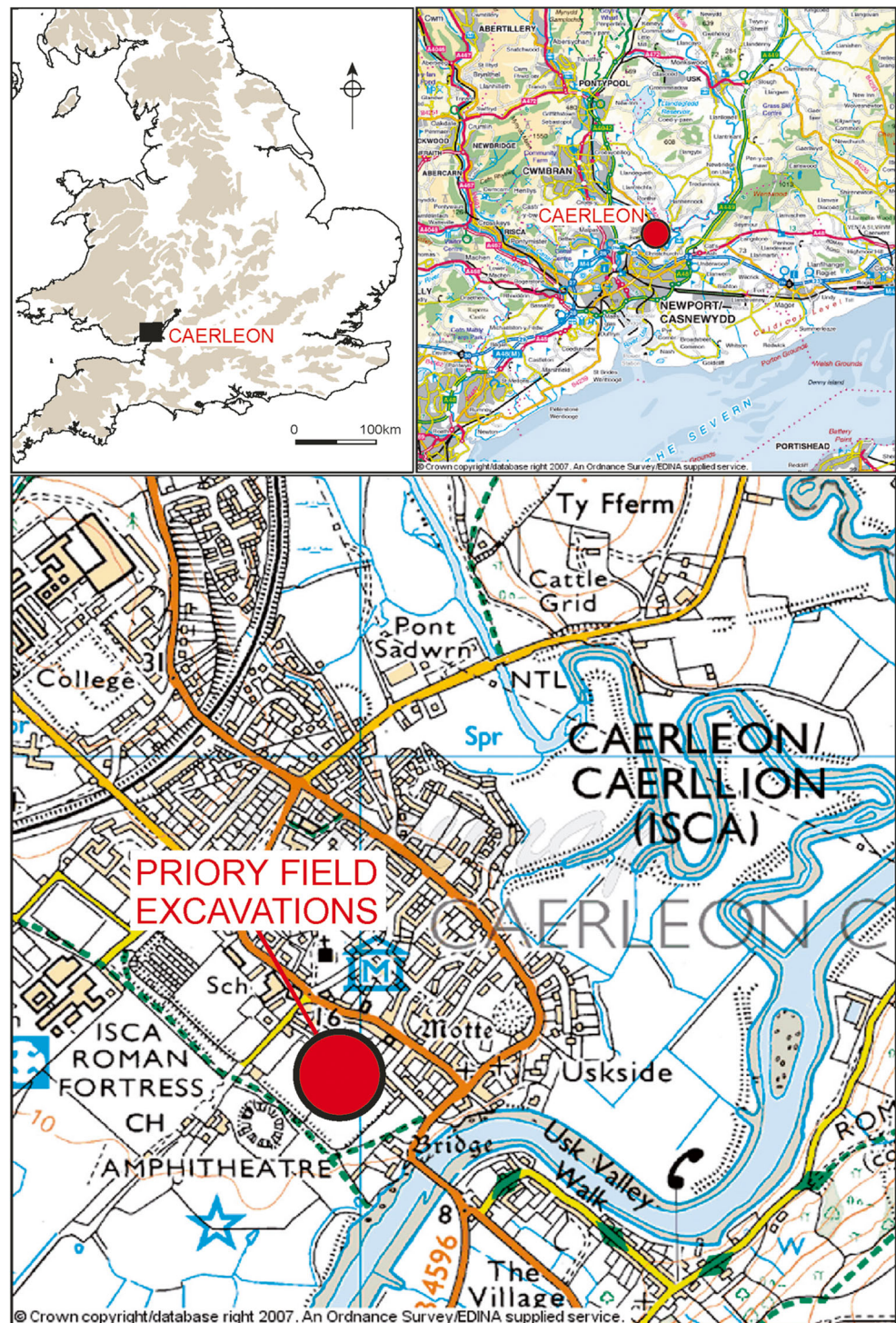
Fig. 1 Location map of Caerleon

some early developing teeth (M1 or dp4), enamel from closer to the root-enamel junction (REJ) was sampled, so that specimens did not represent radically different periods in the animals' lives. Where preservation allowed, the buccal surface of distal cusp units (in the case of molars) was sampled. Only teeth that showed wear were used, as these would be highly or fully mineralised and therefore more resistant to diagenetic