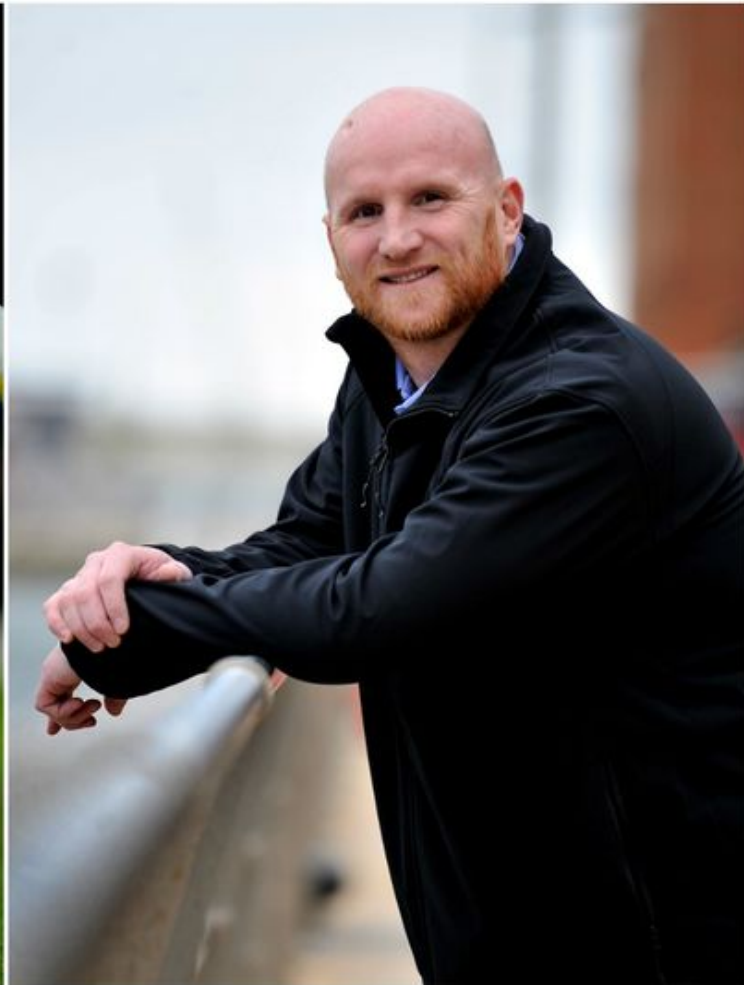
Michael Chopra and John Hartson are two top-level footballers who have struggled in the past with gambling habits